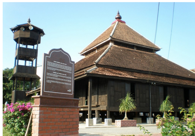
Figure 1: Kampung Laut Mosque