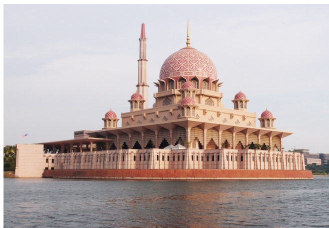
Figure 6: Putrajaya Mosque

As a result, the post-independence era saw the rise of many Islamic movement throughout the country dominated by political base Islamic group like PAS as well as religious base Islamic group such as