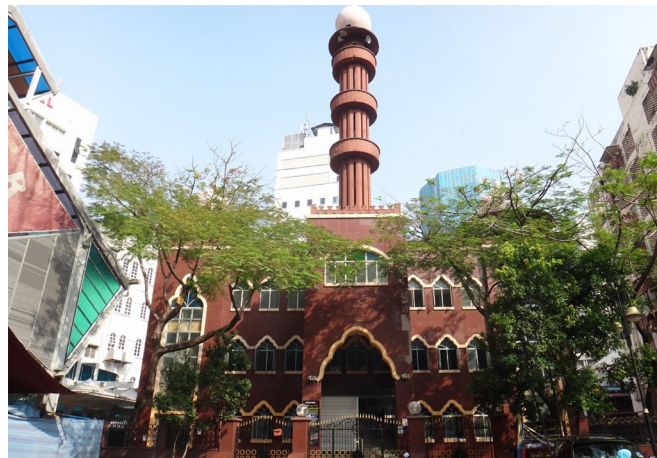
Figure 5: India Mosque, Kuala Lumpur.

On this account, mosques were widely constructed throughout the country not only by the colonials but also by influential individuals in society and private da'wah groups using available capacity (Ahmad 1999; Nasir 1984). Nevertheless, the individual funded mosques are very basic in shape using wood and concrete (Ismail, A.S., 2008). These type of mosque are located in rural areas to cater for locals and villagers. The type of mosque they produced typically portrayed the traditional typology outlook and is smaller in scale compared to the royal mosque (Rahman, 1998).