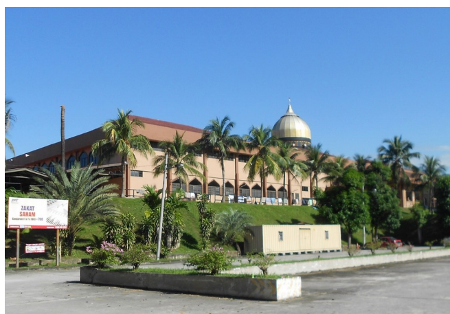
Figure 8: Seri Petaling Mosque