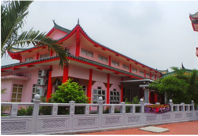
Figure 9: Chinese Mosque, Ipoh, Perak