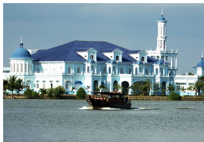
Figure 3: Jamek Muar Mosque