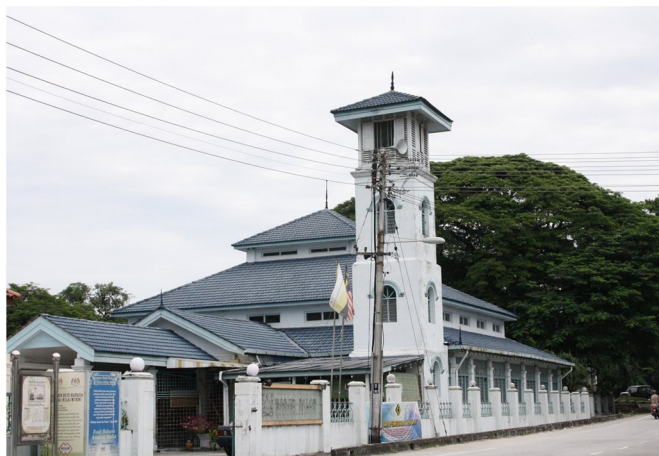
Figure 4: Paloh Mosque