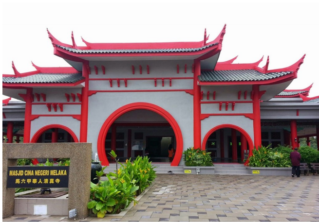
Figure 10: Chinese Mosque, Melaka: (Source: masjid.melaka.gov.my/)

Islamic philosophy that emphasis on mundane devotional experience that emphasis on the concept of da'wah rather than material development (Ismail, A.S., 2010).