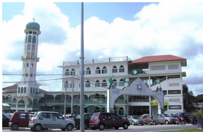
Figure 7: Rusila Mosque