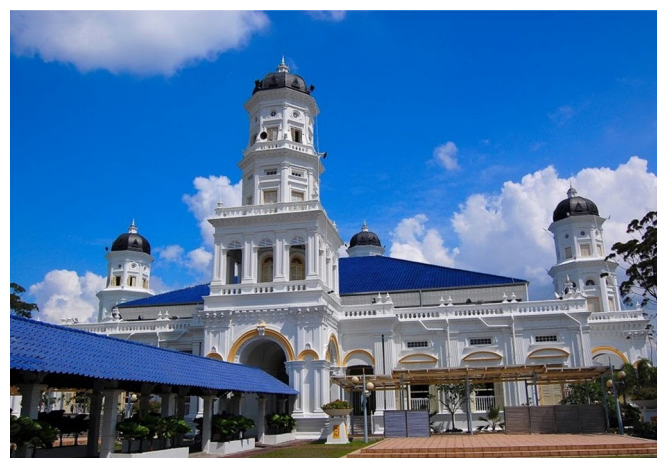
Figure 2: Sultan Abu Bakar mosque

and Singapore (Andaya, 2001). The Straits Settlements were placed under the control of the East India Company in Calcutta, however, by 1867, the seat of administration transferred to the Colonial Office in London. The British influence and intervention over the Malay states began to accelerate further after the signing of Pangkor Treaty in 1874. By the turn of the 20th century, the colonial administrative apparatus was quickly established in the states of Pahang, Selangor, Perak, and Negeri Sembilan, to form a Federated Malay state. British residents were appointed to advise the Malay rulers in these states. For the unfederated states like Johore, Kedah, Perlis, Kelantan and Terengganu the acceptance of British advisors came at a much later period. Even though the colonials showed different period of influence in various Malay states, in the long run the outcomes of their administration were much similar and consistent (Andaya, 2001). The colonial phase presented a gradual transformation in the local scene and traditional Malay society from the aspect of social culture, politics and religious institutions (Parkinson, 1960). These significant changes were brought upon by an increased contact with foreign cultures made possible by Muslims from other lands like the Middle East and India, and due to the intensive indoctrination of colonial ideology and administrative policy (Yegar, 1979).