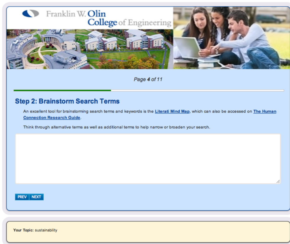
Figure 3. This screenshot shows “Step 2” of the activity with the research log at the bottom.

Both the librarians and faculty members are able to view their students' work in this tutorial through a back end system. This was important for both grades as well as intervention for research help. Students are emailed a copy of their work and have the option of downloading a PDF at the close of the tutorial.