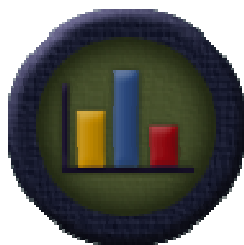
Figure 4. Draft data badge.