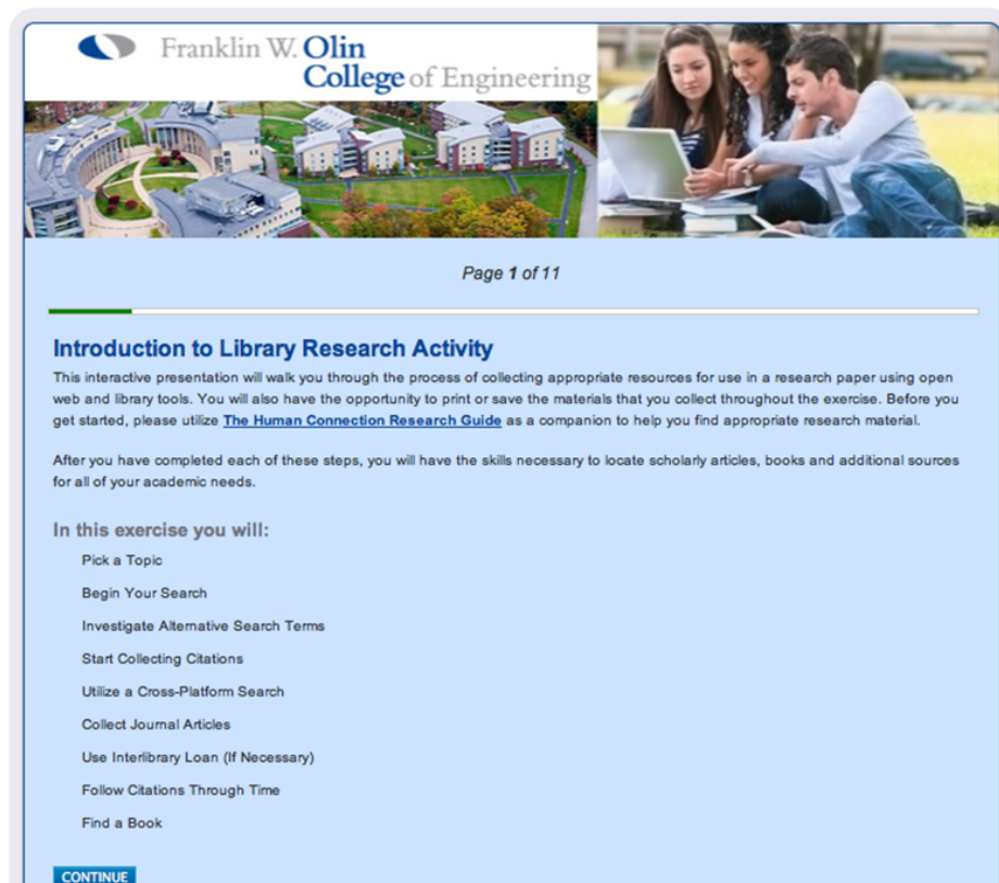
Figure 2. This screenshot shows the opening page of the digital learning activity.

The success of these materials relied on the valuable insights of Olin librarians and faculty, to address themes both relevant to Olin and specific to the courses receiving information literacy instruction. With the pre-work completed during the first phase of the project, the creation of the multimedia materials was shortened. Olin College's tutorial on the research process is intended to provide increasingly focused guidance on research strategies. Please see below for two screenshots from the learning activity. The first screenshot (Figure 2) of the tutorial shows the introductory information for the activity. It was customized to make the Olin College undergraduate students feel comfortable and secure with the project and uses images from their campus. The second screenshot (Figure 3) shows "Step 2" of the activity. Please note the yellow box below the activity where the student's research record is being formed. It was important to make sure this area is interactive, allowing students to copy and paste the resources they are gathering.