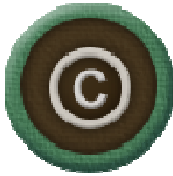
Figure 5. Draft copyright badge.

A shared set of badges that can be earned by undergraduate STEM students anywhere, anytime will free specialized staff at institutions to focus on advanced instruction and more individualized student and faculty interactions. Badge programs are already in place or being developed in universities such as Purdue, Carnegie Mellon and the University of California. The Mozilla Open Badge Infrastructure provides specifications to organizations who wish to create badges, as well as badge storage with their Backpack , where individuals can save and track their badges.