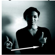
Fig. 2 Movement prediction

Accurate prediction of location information is also crucial in processing location-dependent queries.