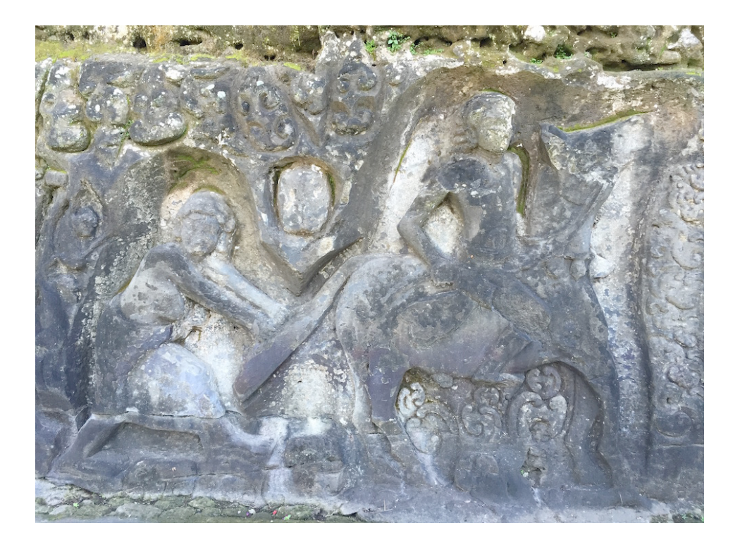
Figure 1 One of the fragments of Yeh Pulu relief, showing a prince about to spur his horse, but he is hindered by the horse's tail that seems like it is suddenly pulled by a princess.

A similar view suggests that Yeh Pulu relief configuration is almost realistic as Ramseyer (2002: 45) says that "the figure of a man riding a horse only wearing a piece of short cloth and a belt. His long hair touches his shoulders. He rides the horse without any saddle, and is seen to force his horse to run". This statement gives the impression that the scene on the relief was depicted in such great detail that the saddle was left out in the depiction, in order to show a dramatic scene of a prince about to hurry away spurring his horse, clearly showing a realistic portrayal. Further, examining the work's visual it is clear that the figural depiction of the relief's subject comes even close to the normal human proportion, and the slightly taller figure is certainly very ideal to portray the horse rider's heroism in the scene.