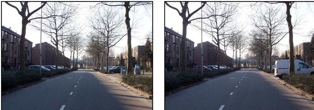
Figure 1. An example of a simple (left) and complex (right) situation in the Adaptation Test

To study the extent to which complexity affects adaptation to task demands we used driving speed, because reducing speed is the most straightforward way to decrease task demands (e.g. Quimby & Watts, 1981). The respondents were asked to assess at what speed they would drive in the depicted situations. Neither in the instructions nor in the pictures was an explicit reference made to the legal speed limit. The situations were selected in such a manner that the "extra" element would increase the complexity of the situation, without legally obliging the driver to lower his speed. In Figure 1, for instance, a driver is allowed to drive at the same speed, and has right of way, in both situations.