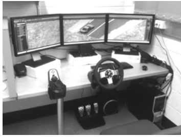
Figure 1. Driving simulator set-up