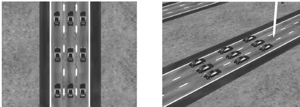
Figure 1. Vehicle tracking stimuli from ‘birds eye’ (left) and isometric (right) view angles

Tracking tasks took place within a Drivesafety DS 600C fixed-base driving simulator. The simulator body is a modified Saturn sedan, and the projection system provides a 300-degree wrap-around display consisting of 5 screens in the front and 1 in the back (250 and 50 degrees, respectively). The simulator display operates at 256 colors, with a refresh rate of 60 hz. A standard 3-lane “freeway” style roadway-simulation, with no turns, was modified such that 9 identical blue cars appear in front of the participant vehicle in a 3 x 3 grid, as shown in Figure 1. In the ‘object tracking only’ condition, vehicles in the row closest to the driver (row 1) subtended an average visual angle of 2.97°, ranging from 2.01° at the most distant position, to 3.44° at the closest position. The vehicles in row 2 and 3 subtended an average of 2.1° degrees (range 1.9° to 2.3°) and 1.86° (range 1.72° to 2°), respectively. In the ‘multiple task’ condition the precise visual angle of the object vehicles was similar to that in the ‘object tracking only’ condition, but depended on participants' performance on headway maintenance task.