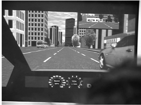
Figure 1. A car merging to the center lane

were to be the final judge of when or whether to respond to any signal during the virtual drive. It was emphasized that safety was their primary concern, even though the environment was simulated.