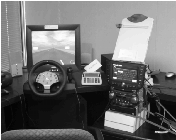
Figure 1. LCT Equipment Set Up

The top frame of Figure 2 shows the driver's view of the simulated three-lane road scene with signs instructing the driver to change into the left lane. The middle frame illustrates the difference in area (black) between the normative path and actual path for a quick response (adapted from Mattes, 2003). The bottom frame illustrates performance during a slower lane-change response where the greater black area indicates poorer performance.