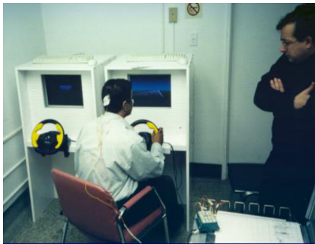
Figure 1. A subject’s brainwave activity is monitored via EEG while using simulator