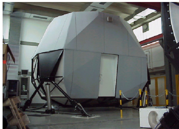
Figure 1. Scale model and exterior photograph of truck-driving simulator

The images above show a scale model of the simulator with an exposed canopy to reveal the orientation of truck cab, screen and projectors, and also an exterior photograph of the prototype system. The full system is aimed to be operational in October 2003 at the TRL headquarters in Crowthorne, England.