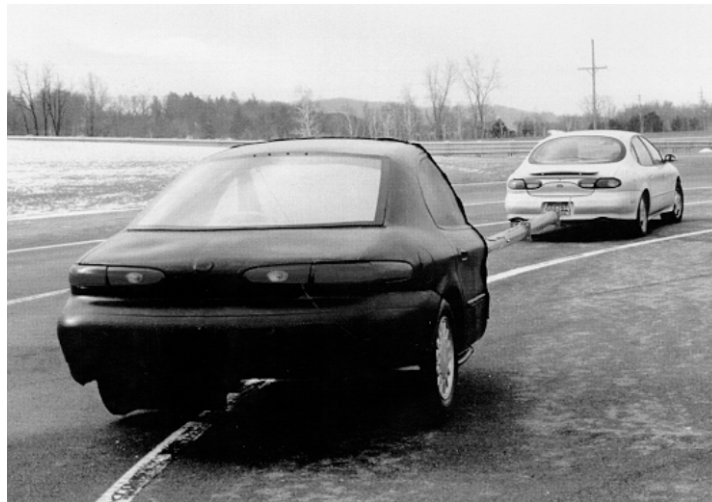
Figure 3: An example of a Surrogate vehicle test

The study, which is to be performed toward the end of 2001 will use a combination of two methods. Firstly, a surrogate vehicle/test track approach (e.g. Fig. 3), where subjects will be asked to follow a towed impact resistant target in an instrumented vehicle, with the driver of the vehicle towing the surrogate target performing several braking manoeuvres (larger than -4 \text{ m/s}^2 ). In support of this method these experiments are to be replicated on a fixed base driving simulator in order to both examine the advantages of the differing methodologies and (if validity is proven) to increase the size of the database.