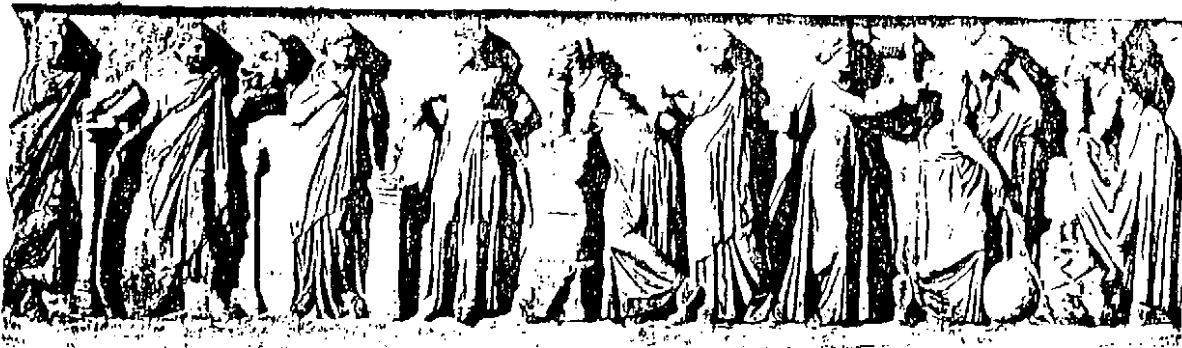
The nine Muses, the inspiring deities of song, depicted with their various attributes on an antique sarcophagus. Paris, Louvre.

Even though Chaucer uses the Muses to foreshadow, highlight mood, and show a culmination of learning, the nine sisters are more ornamental, rather classical sculptures depicting human endeavor than anima projections or sources for knowledge. There is little dependence on these classical figures so depended on in Hesiod and Virgil.