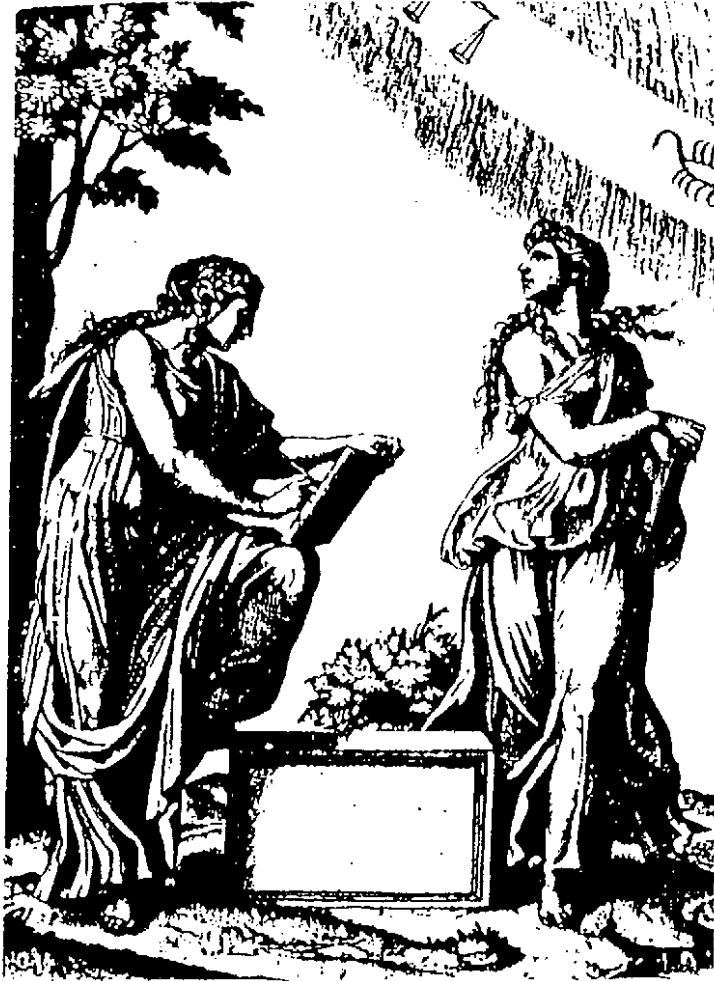
Figure 5. Engraving by Marcantonio Raimondi after Raphael. "Touched by the celestial music of the spheres, Urania has closed her book and appears to be seized with an ecstatic rapture, whereas Clio, bound to the earth, records the deeds to be remembered." (From a private collection)

Divine inspiration, truth, and song are again brought together as it was in the beginning.