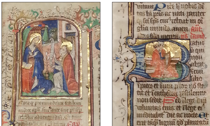
FIGURE 3. Annunciation, from the Reno Breviary, fol. 1 (left) and David playing the harp, from the Reno Breviary, fol. 129 (right).

quires are missing; the Sanctorale is lacking sections for February through March and September through December. The book ends imperfectly (in the middle of August of the Sanctorale), and any flyleaves that may have been at the end have been lost. As damaged as it is, enough of the sanctorale and litany survive to definitively localize the manuscript. The preponderance of liturgy devoted to the veneration of St. Julian of Le Mans, including his translation, places the manuscript in the Cathedral in Le Mans, France, southwest of Paris: the temporale Office for the Dedication of the Church (fol. 73v) includes liturgy for the translation of St. Julian; the sanctorale includes saints of Le Mans import including Domnolus (1 December), Gervasius and Prothasius (Le Mans date of 13 December as well as feast and octave), Gatianus (18 December), Thuribus (16 April), Austregisilus (20 May), Caruini (28 May), Bertrannus (translation, 6 June), Pavacius (24 July and translation on 9 July), and, of course, St. Julian (translation, 25 July). The manuscript is interesting in and of itself—not only are there very few known liturgical manuscripts that can be so clearly associated with Le Mans, but of those, the Reno breviary is