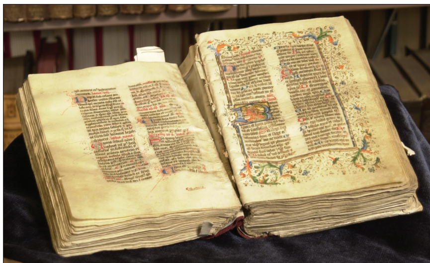
FIGURE 2. The Reno Breviary (Reno, University of Nevada, Special Collections, ND2895.R46 U65 1400z).

cathedral's niche. The identification is circumstantial, but is supported by the history of the manuscript as well as its codicological features. It is not only the manuscript's origin that is of interest; just as intriguing is its journey to Nevada.