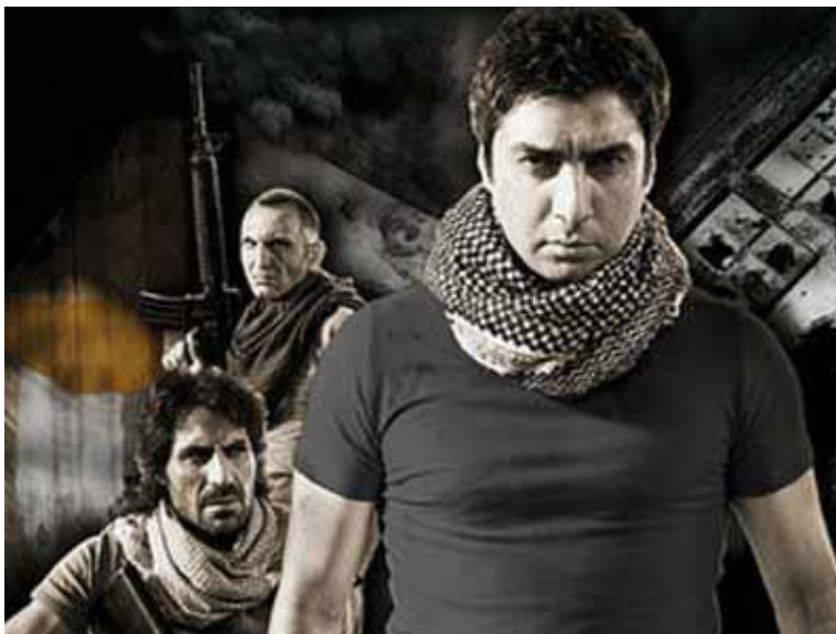
Necati Şaşmaz as Polat Alemdar in a poster for Valley of the Wolves