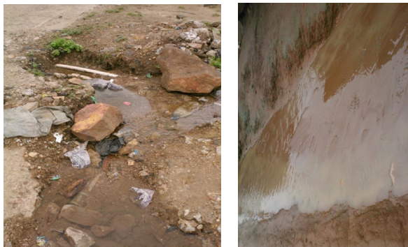
Figure 5: Unimproved source, leaking/burst pipe and running water in gutter/channel Locations at Adigbe, Akole-Oke Ata