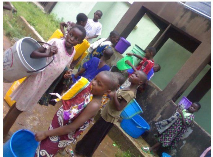
Figure 1: A private water point (borehole) at residence in Adigbe (seven girls and three boys)

Examples of unimproved water sources include hand-dug wells that are uncovered and have no masonry support, allowing people collecting water to fall inside, as well as the pools of water around wells or boreholes that often foster fungal diseases when children dip their feet in the dirty water.