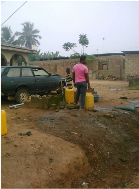
Figure 4: An unimproved water source, a private water point at Obantoko where people are prevented from collecting water