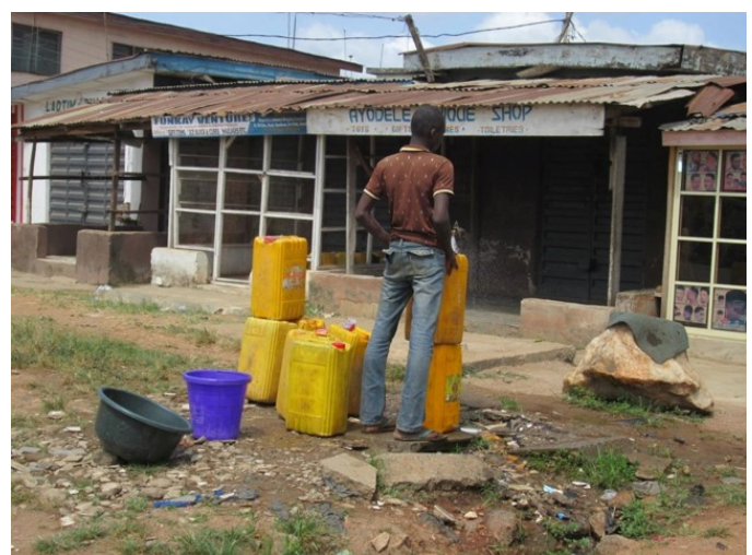
Figure 3: One of the children fetching water on Sunday morning at Akole-Oke Ata, the jerry cans displayed