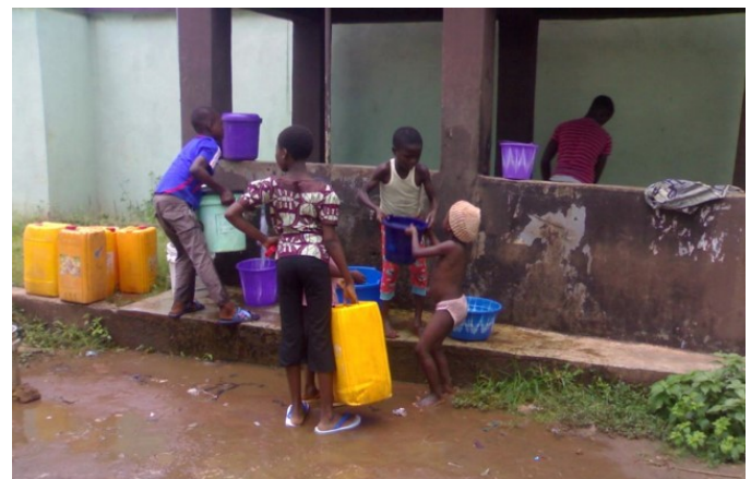
Figure 2: The children helping each other carry jerry cans of 25 liters capacity