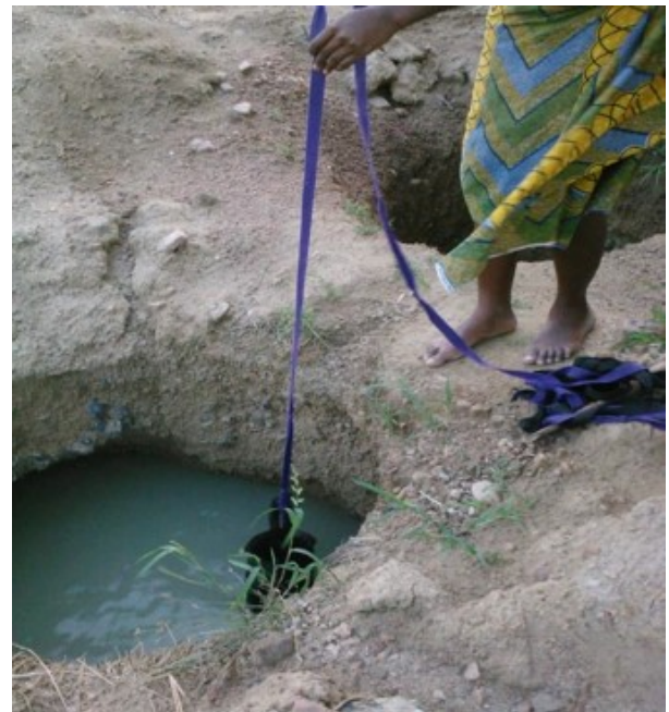
Figure 6: A girl without footwear collecting water from a soak away pit under construction, filled up with runoff. Located at Akole Oke Ata