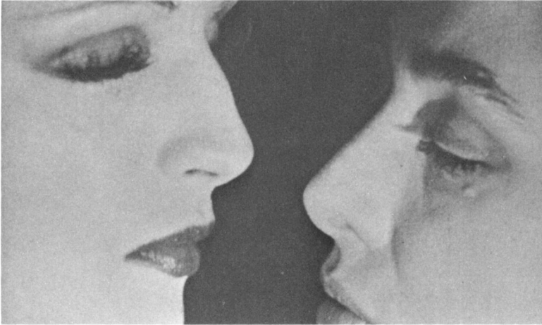
The Death of Maria Malibran

coincides neatly with the film that is Willow Springs : with funds for a film about Marilyn Monroe Schroeter set out for Los Angeles to make the film; there, however, “everything was too obvious” and Schroeter made instead Willow Springs , a film in which, as I’ve been indicating the spectre of Marilyn Monroe as the epitome of a cinematic type might be considered part of the polemic. Schroeter’s outright detour from Hollywood here in order to explore the less obvious is indeed what best characterizes his early films; and by way of this detour Schroeter has been able to examine and exhibit crucial questions about the constitution of the filmic spectator and the representation of the cinematic subject, questions that would certainly never occur in a Hollywood film such as Altman’s Three Women .