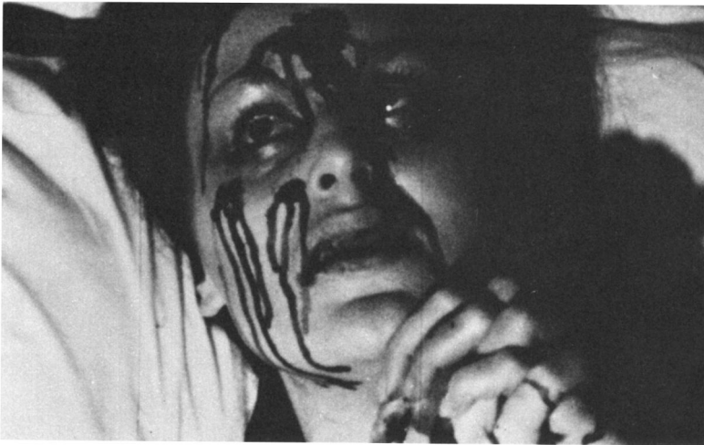
The Death of Maria Malibran