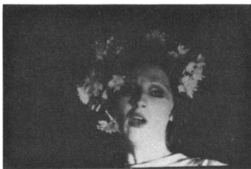
The Death of Maria Malibran

This last passage indicates quite lucidly, I believe, how operatic discourse informs the visual representation in Schroeter’s film where the vertiginous and illogical movement of the film’s progression undercuts standard narrative landmarks and results in a sort of visual non-sense. In the narrative form as in the innumerable close-ups of still and staring faces, the visual exhibition of Willow Springs becomes a visual excess whose very point is the transgression of normal modes of euclidean representation. Just as the story line itself describes a conflict between Magdalena’s struggle to express herself and the world outside that threatens her, each shot contains an excessive signification that clashes with the representation. The terms of this conflict, moreover, are such that the beauty of the transgression is inseparable from death. Hence the film’s title. Hence, the many shots of a magnificently brilliant desertscape.