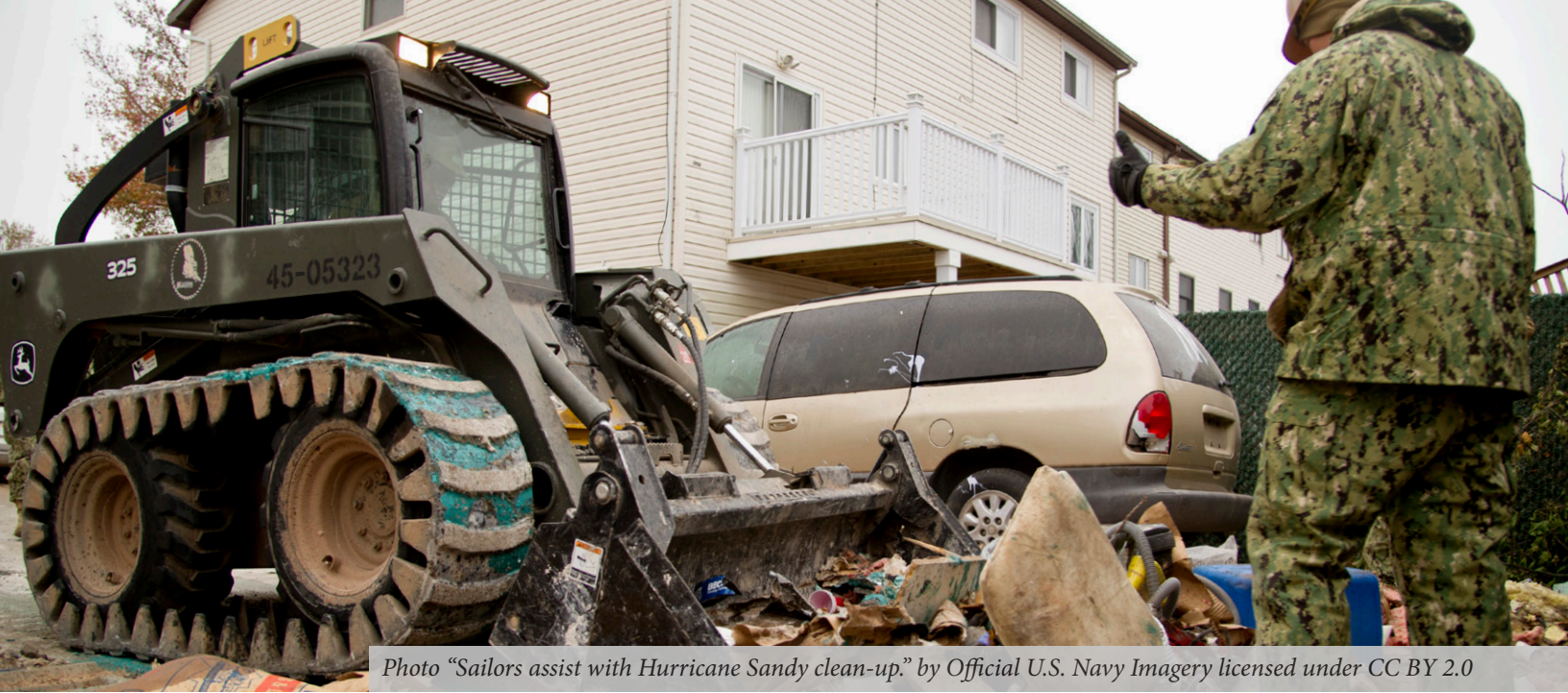
Photo "Sailors assist with Hurricane Sandy clean-up."

poverty and vulnerability. Thus, grassroots groups such as Alliance for a Just Rebuilding, a coalition of faith groups, labor unions, community groups, and policy and environmental organizations, frame recovery in terms of good jobs, affordable housing, renewable energy, accessible health care, and community consultation for recovery plans rather than returning New York City's status quo (Alliance for a Just Rebuilding 2013).