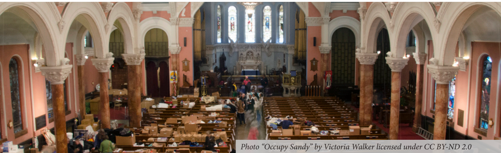
Photo “Occupy Sandy” by Victoria Walker licensed under CC BY-ND 2.0

and apply them to disaster relief. Hurricane Sandy was no exception. The problem is that this approach unjustifiably privileged some groups over others. In some cases, the decision was deliberate. For example, the first iteration of New Jersey's state action plan directed far more aid resources at homeowners than renters, when both were, and continue to be, homeless (Fair Share Housing Center 2013; Coalition for the Homeless 2013). In other cases, pre-existing categorizations meant that vulnerable populations were overlooked.