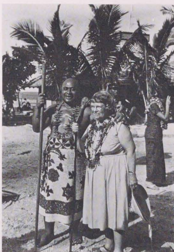
▲Return to Samoa, 1971.