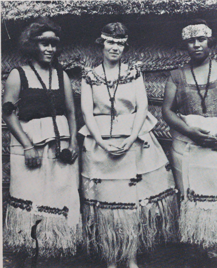
First field trip: Samoa.