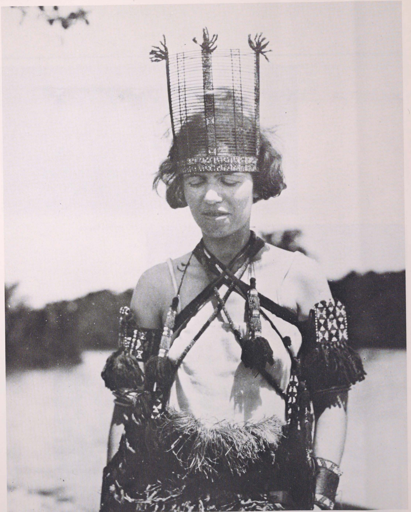
Wearing mourning dress at a funeral, Peré Village.