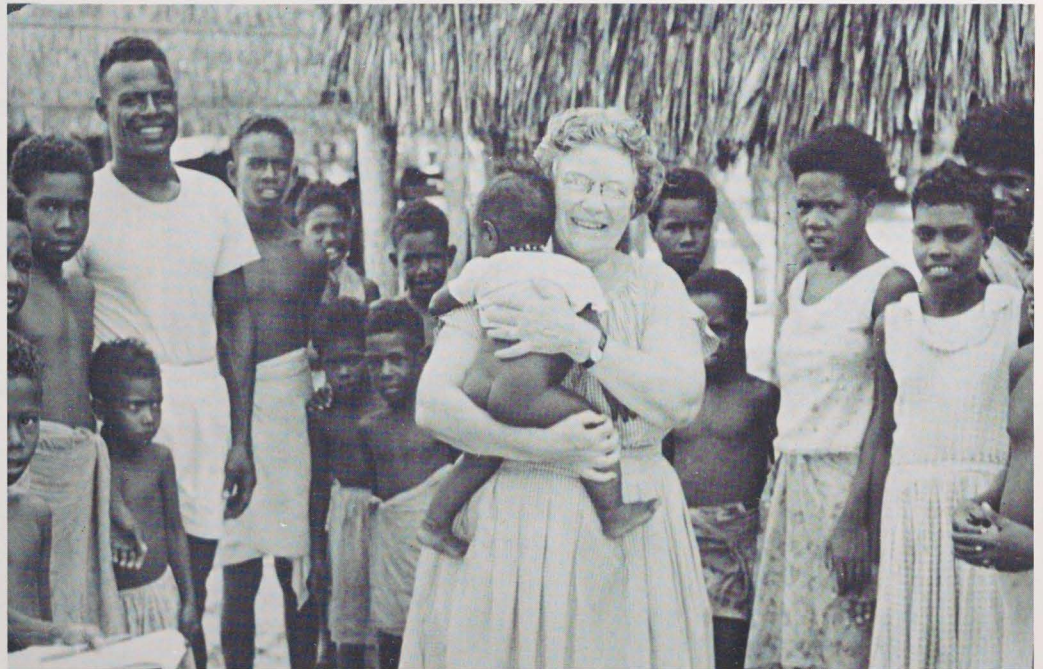
In Peré Village, 1964. ▶ (Courtesy of Lola Romanucci-Ross)