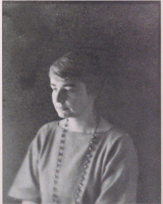
Teacher and friend: Ruth Benedict.