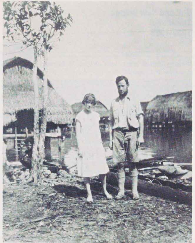
▲ With Reo Fortune in Peré Village. (Courtesy of Reo F. Fortune) ◀ Carrying Piwen, about 2 years old. (Courtesy of Reo F. Fortune)