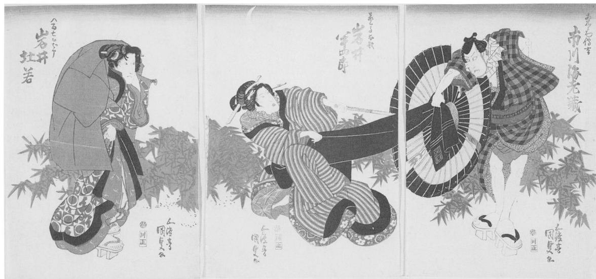
346. Kunisada, Iwai Tojaku as an Old Woman, Iwai Hanshirō VI as a Geisha and Ichikawa Ebizō as Tozaemon Denkichi , woodcut, 380 × 750 mm (Birmingham City Museum).

kabuki theatre fan to preserve prints he or she had purchased over the preceding two decades. All of the prints depict the actors in full figure; there are no half-length portraits. No particular actor or group of plays predominates, but two thirds of the prints were issued between 1828 and 1831, and the majority (69 of the 81 sheets) are by Kunisada (1786–1865). There are also designs by three of Kunisada's contemporaries: Kuniyoshi (7 sheets); Toyokuni II (3 sheets); and Kuniyasu (2 sheets). Kunisada was the most prolific and commercially successful designer of actor prints between 1812 and his death, early in 1865. It is therefore no surprise to find his work figuring so prominently in the Birmingham album.