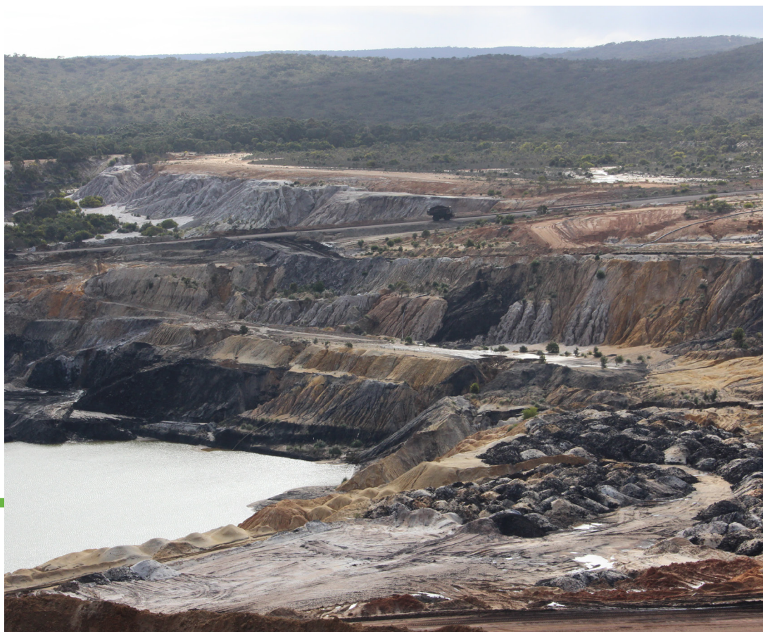
The ALCOA Anglesea open-cut coal mine extracts exclusively brown coal, which is used to generate energy at the nearby power station.

Australia sits upon a throne of coal. The nation's brown and black coal industries bring immense wealth through the exportation and industrial uses of coal, as well as the jobs it creates. Although Australia benefits from coal economically, it is also hurt by it environmentally. Coal combustion, extraction, and transportation have far-reaching impacts. For example, these processes result in pollution, greenhouse gas emissions, and reduction of biodiversity through coral bleaching. Despite outcry from the public, the Australian Liberal National Party under Tony Abbott's administration does little to mitigate these industrial harms, as they fear economic ruin if the country chooses to divest from coal. Economic ruin, however, is avoidable, as long as Abbott's administration seeks alternative options to coal, such as solar energy and liquefied natural gas.