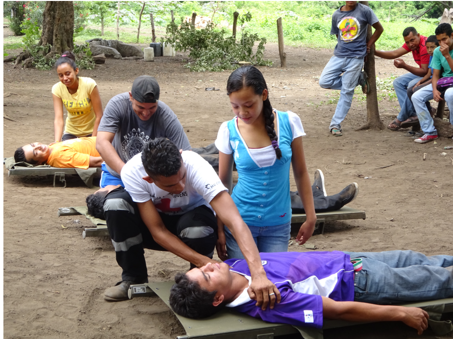
Figure 4 Telica community members receive Red Cross emergency training as part of the Fuertes Juntos' tourism development project (Bridges 2015).