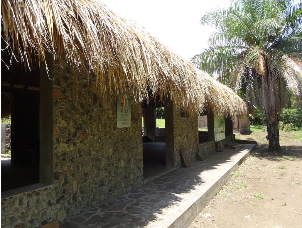
Figure 9 The unfinished hostel constructed by Fuertes Juntos personnel with funding from the European Union (Bridges 2016).