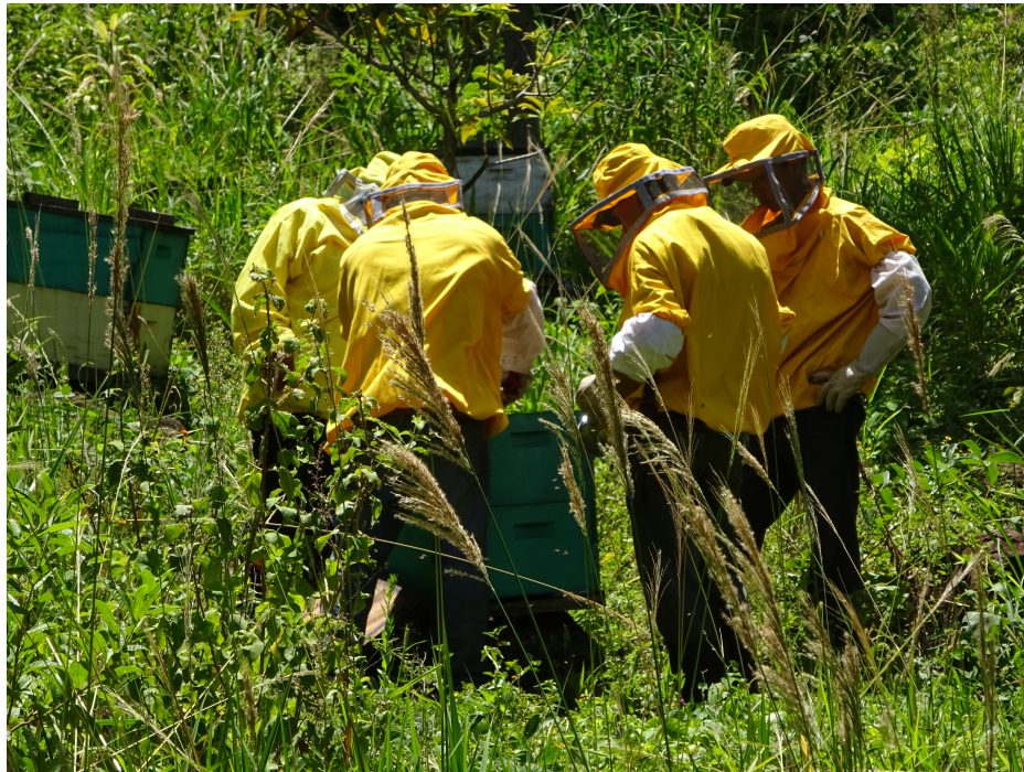
Figure 3 A Fuertes Juntos beekeeping specialist trains community members (Bridges 2015).