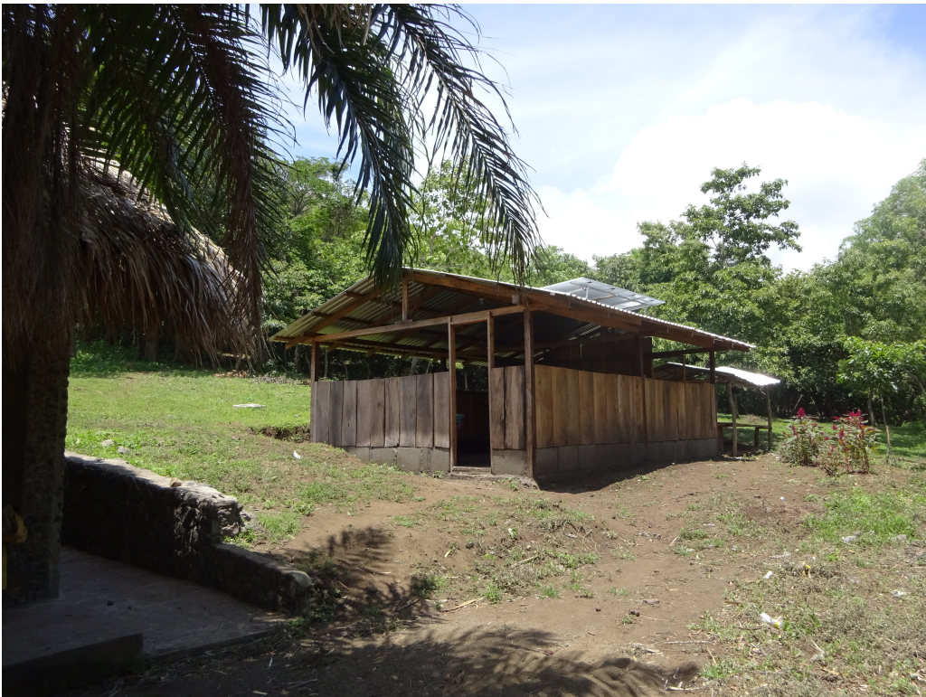
Figure 8 New café built by Telica Unida with the help of a grant from the Peace Corps (Bridges 2016).