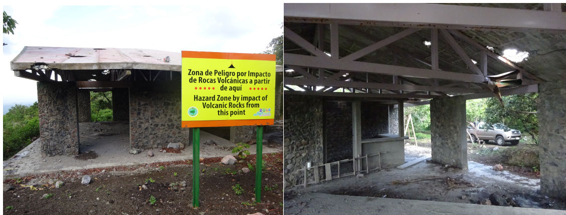
Figure 6 Image taken following the November 2015 volcanic eruption. The roof sustained significant damage, and its structural integrity was threatened (Bridges 2016).