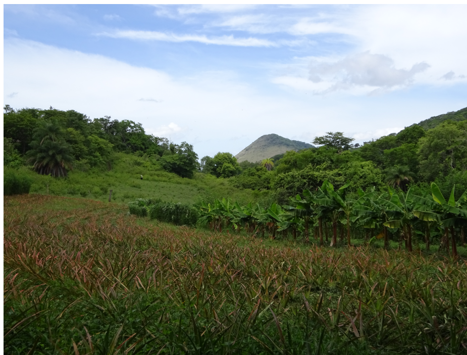
Figure 2 One of Fuertes Juntos' five model farms (Bridges 2015).