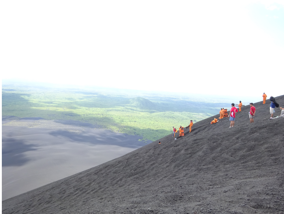
Figure 1 Tourists prepare to sled down Volcán Cerro Negro in a popular tourist activity known as "volcano boarding" (Bridges 2015).