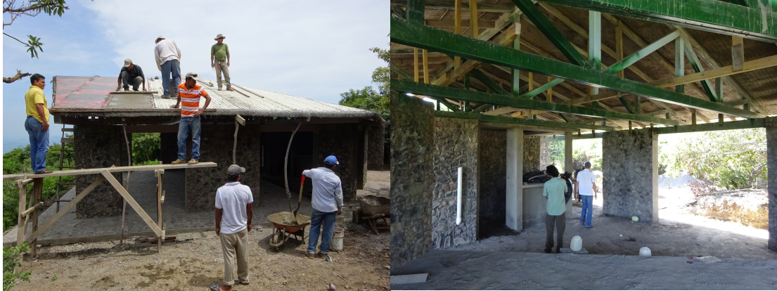
Figure 5 The café Fuertes Juntos built on the Telica volcano during construction; image taken before the November volcanic eruption (Bridges 2015).