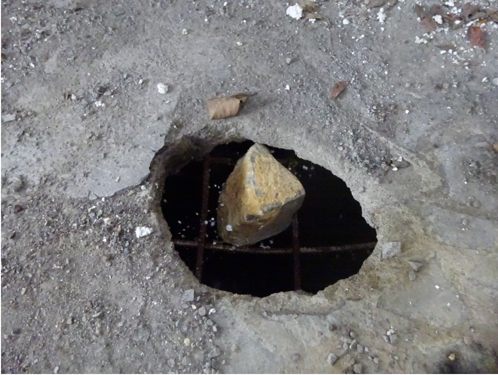
Figure 7 A hole formed in the concrete floor from the impact of a high-velocity rock from the November 2015 eruption (Bridges 2016).