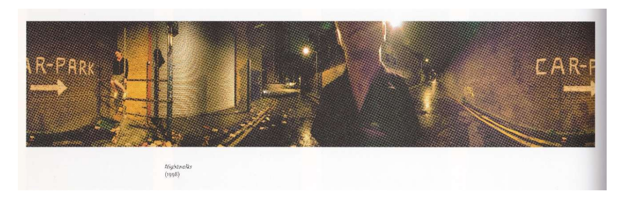
Figure 3. Page 34 from Void Spaces.

between subject and viewer, but also seems to recognize the existence of a viewer. Moreover, in the context of the Nightwalks CD-rom's programming, this photograph enacts Barthes' punctum. Having clicked through the previous image, the one below appears, the closeness of its subject startling the viewer out of any spectatorial passivity that they may have retained through other photos. This image has the power to startle the viewer by confronting them with a profoundly uncomfortable proximity which seems to implicate the viewer in the photograph. Though only the lower half of the man's face is visible, he seems to direct towards the camera his displeasure, with his stance appearing accusatory. No matter the intention, the image's composition demands recognition from the viewer it confronts.