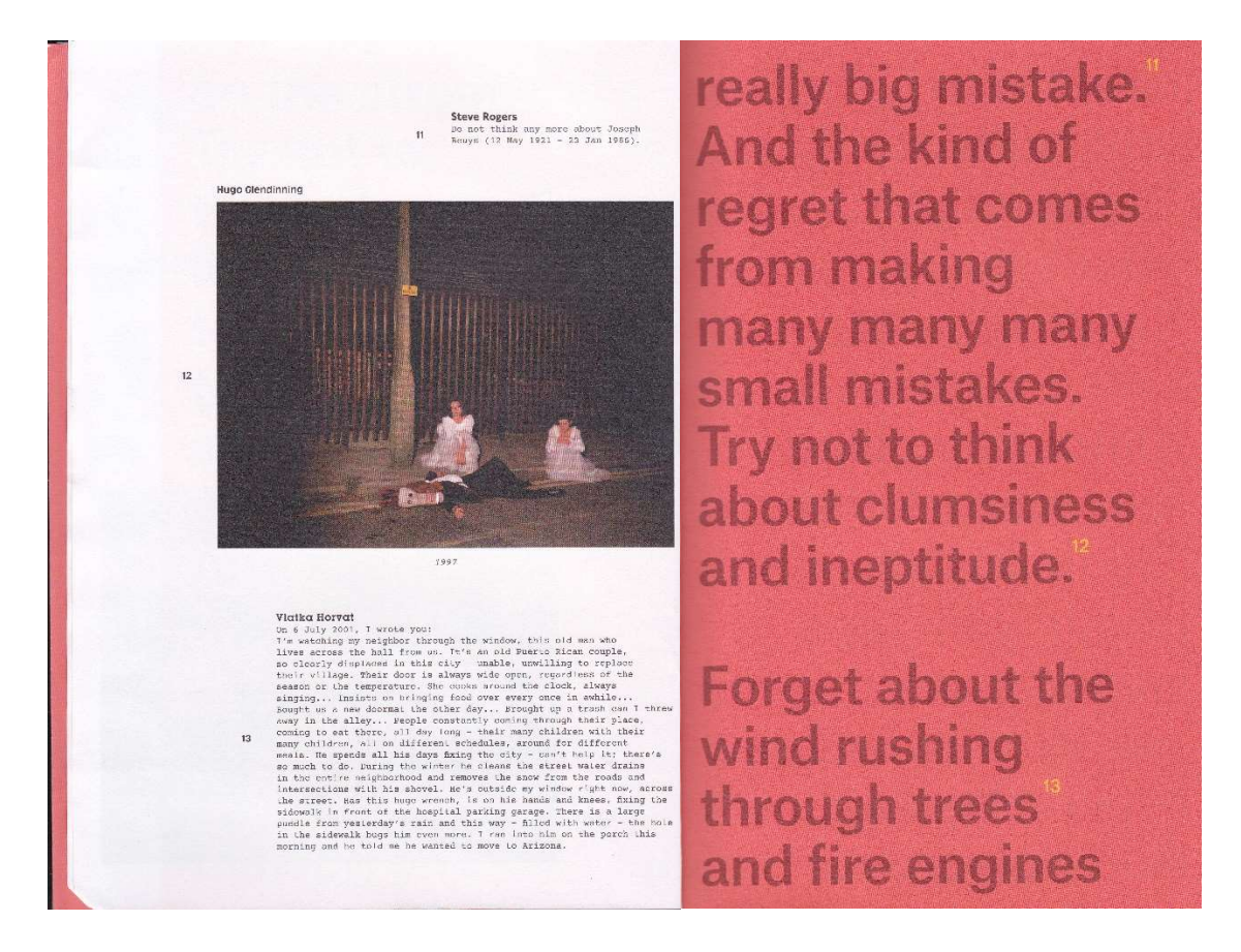
Figure 1. Pages 7 and 8 from While You Are With Us Here Tonight (reproduced with permission from Forced Entertainment/Tim Etchells)

The speech which the text ostensibly records is a series of instructions from a performer to the audience before the performance is about to begin, and tells the spectators, "while you are with us here tonight, we'd like to ask you to try to forget about the outside world completely" (i). The speech then lists an extensive set of specific things that the audience is asked to forget. For example, spectators are told to "Try not to think about chemical warfare" (7). Indeed, the attempt to make something absent in fact makes it all the more present: as the performer lists off an increasing number of obscure things that they request that the audience forgets, they actually call them up in our minds. To forget something deliberately, one must first recall it. For instance, the call to "Forget about sweat. The