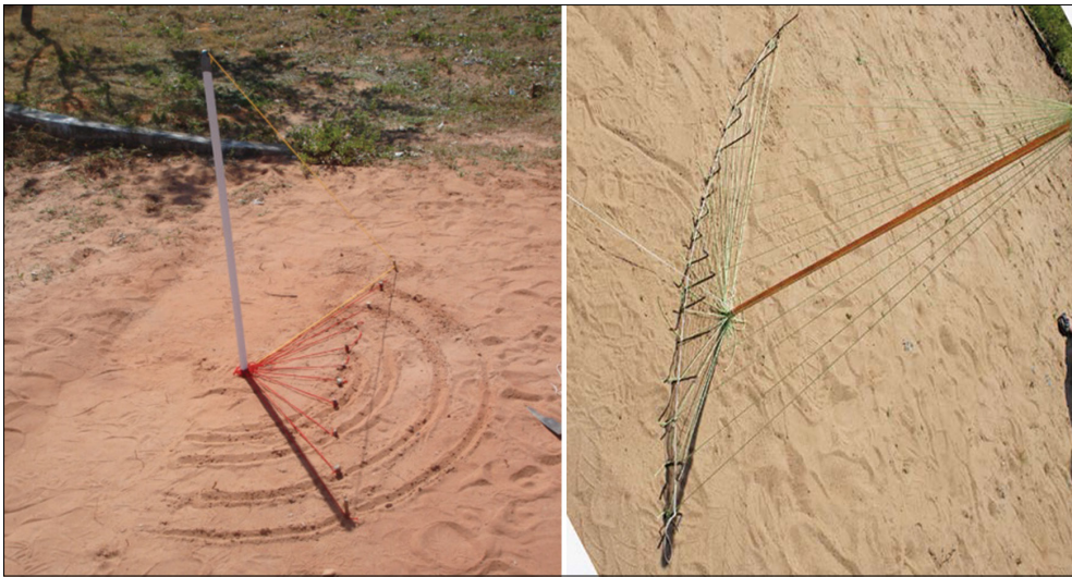
Fig. 2. Two observational settings for studying the shadows cast by 1-meter vertical gnomons during the 2011 December solstice. Left image is from Natal (Lat: 5.8°S), while the image to the right is from Caxias do Sul (Lat: 29.2°S). Theoretical values for the angles between the gnomon and the solar noon threads (the shortest ones) are 17.7^\circ = |5.8^\circ - 23.5^\circ| for Natal, and 5.7^\circ = (29.2^\circ - 23.5^\circ) for Caxias do Sul. Measured values were actually 17^\circ and 7^\circ , respectively. Note that while the concavity of both curves made by the sticks on the ground is approximately the same (the picture on the right was rotated in order to better show this), these declination lines fall on opposite sides of the gnomon: the one in Natal falls to the north of the base of the gnomon and the one in Caxias do Sul to the south. In both images the north is to the right, as can be inferred by the last shadow cast by the gnomons—and visible in the pictures—which, coming from the southwestern setting Sun, points approximately toward the northeast.