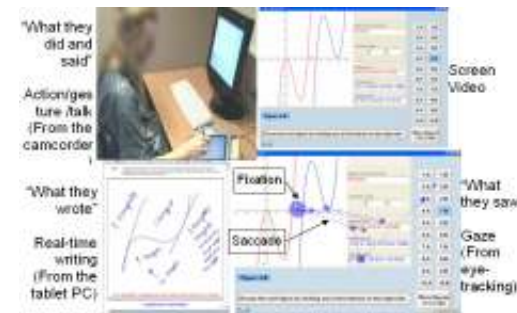
Figure 1: Examples of action, writing, screen and gaze videos

Digital approaches to capturing, coordinating and analysing what the learners said, did, saw, and wrote was recorded digitally and time-stamped so that it could be viewed and analysed as a coordinated whole. The techniques take advantage of the latest analysis software that facilitates synchronisation and encoding of multiple video feeds, eye gazes, handwriting, and verbal transcripts (Figure 1). Utterances and action were captured, using a digital camcorder, as an indication of thought processes that might be occurring; real-time writing and sketching were captured with a tablet PC, to identify additional representations being used; and gazes were captured using an unobtrusive eye-tracking device, so as to identify objects of attention [5].