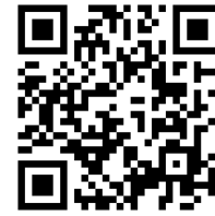
Figure 3. QR code for the Make to Learn wind project.

For decades, educators have employed activity books that guide students through the steps of projects. T-Books, such as our prototype example, build upon and extend this tradition. The prototype T-book includes Quick Response (QR) codes with electronic links to videos and online simulations that expand content in the book. The book also includes links that allow the students to fabricate objects depicted in the book.