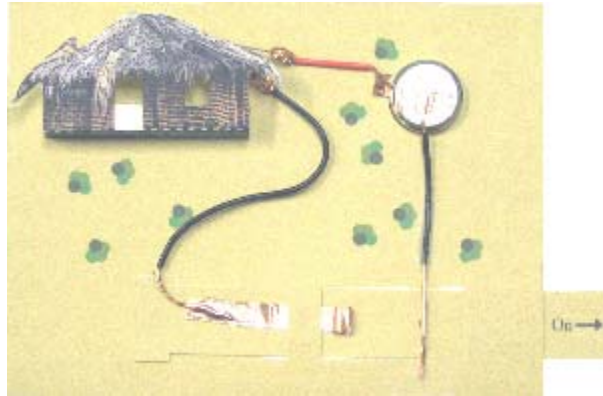
Figure 5. Students also construct working circuits that are incorporated into the prototype T-book.

Video 2 shows students creating electrical circuits using digitally fabricated components and a template provided in the book (see http://www.youtube.com/embed/ekb9IV17PUk ).