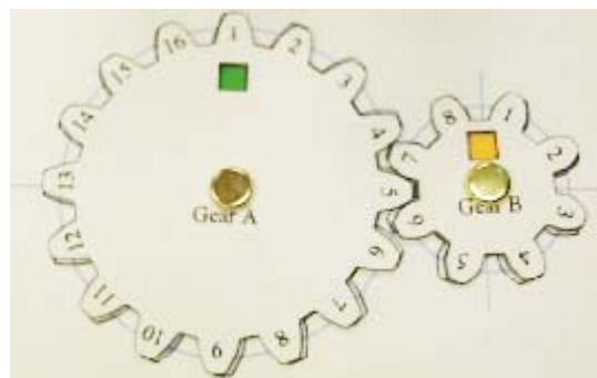
Figure 4. A link in the prototype T-book can be used to fabricate working gears that students incorporate into the book.

Gears, for example, are a critical component of effective wind turbine design. An introduction to gears and gear ratios includes links to electronic files that can be used to construct model gears using 2D and 3D fabricators (Figure 4). This feature allows students to produce and explore the objects discussed in the book and employed in later aspects of the turbine creation.