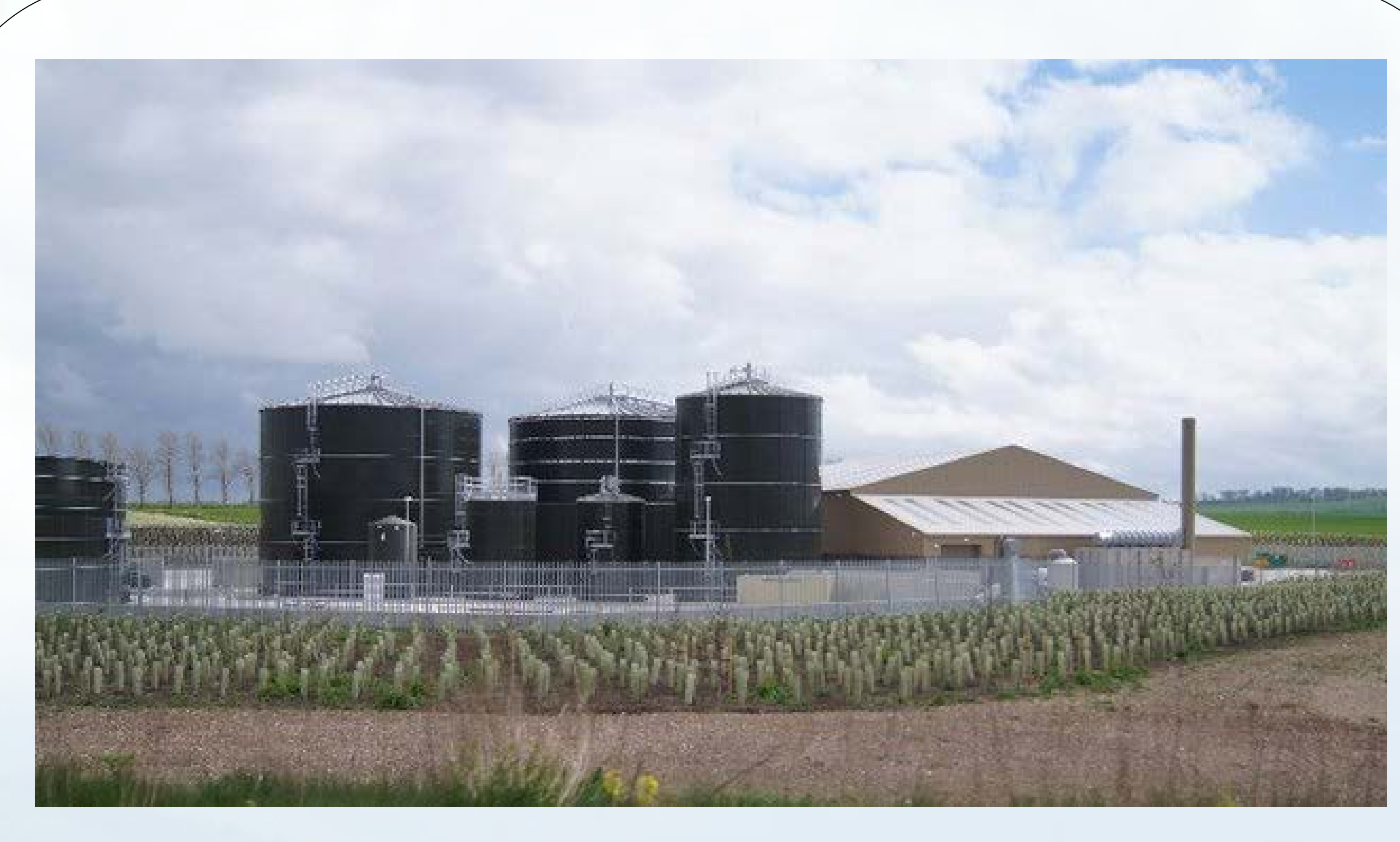
Figure 4. An on farm biogas system similar to what our team plans to install in Chimborazo<sup>[4]</sup>