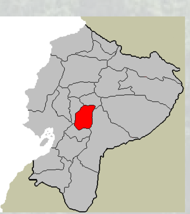
Figure 2. Geographical location of Chimborazo<sup>[5]</sup>