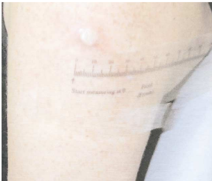
Figure 1. Typical Vesicle on the Upper Arm 10 Days after Scarification.

comparisons of the study groups were made with the use of the Tukey adjustment for multiplicity. All t-tests were two-sided.