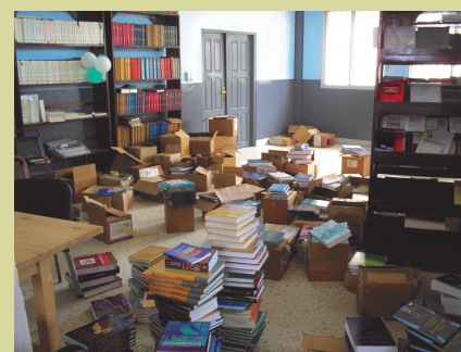
Dogliotti Library receives generous donation of 8,000 volumes to start the medical collection.