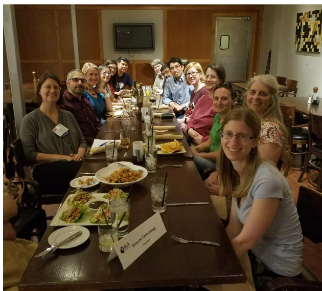
SciTech Division No-Host Dinner