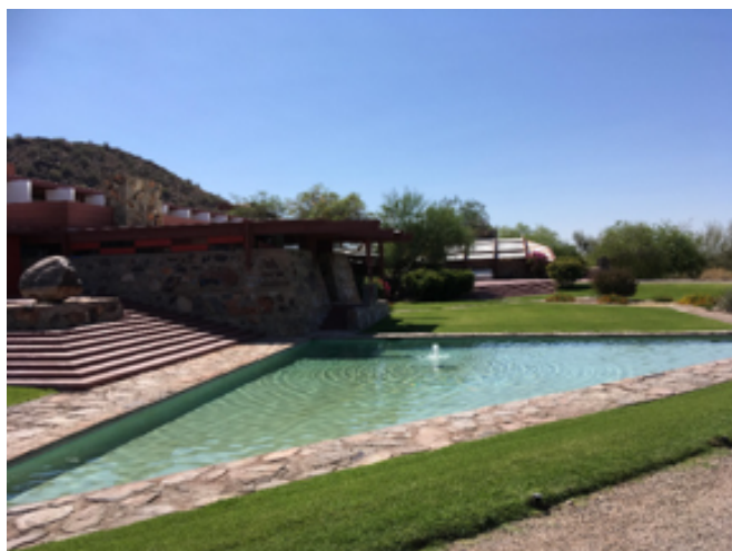
Taliesin West exterior

The forty-three attendees took a ninety-minute guided tour of the structures and gar-