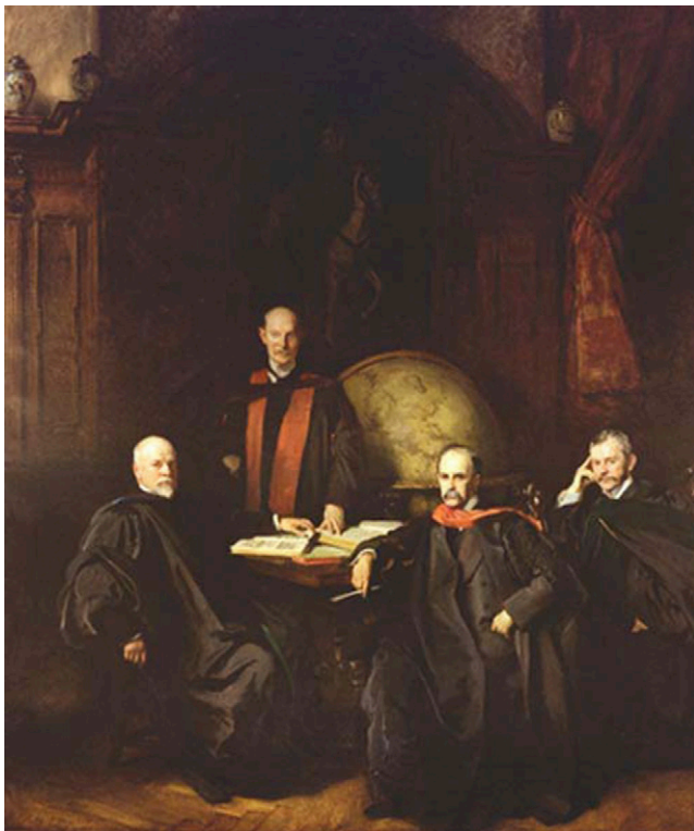
FIG. 2. "The Four Doctors" by John Singer Sargent (1905). Left to right: William Welch, M.D., William Halsted, M.D., William Osler, M.D., and Howard Kelly, M.D.

Aequanimitas , which he delivered in 1889 at his farewell address on leaving Philadelphia to assume his role at Johns Hopkins. In it, Dr. Osler emphasized the importance of imperturbability among physicians. Aequanimitas is the motto of the Osler family crest and still appears on the Osler housestaff tie and scarf at The Johns Hopkins Hospital.