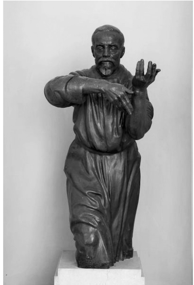
FIG. 3. Bronze monument constructed by Anton Hanak in 1923 portrays Emil Zuckerkandl demonstrating the muscles of his forearm. Reprinted from Ober et al. 2

Today, Zuckerkandl is best remembered for identifying and describing the body's largest complex of extra-adrenal chromaffin cells or paraganglia (Fig. 2). Although Zuckerkandl first noticed these complexes in 1901, he mistakenly characterized them as lymph