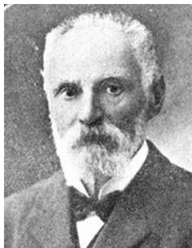
FIG. 1. Portrait of Edoardo Bassini. Reprinted from Edoardo Bassini. Wikipedia, the free encyclopedia . Available at: http://it.wikipedia.org/wiki/File:Edoardo_Bassini.Gif . Accessed January 29, 2012.