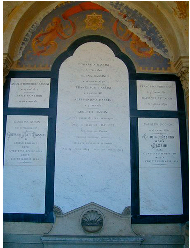
FIG. 3. Tomb of Edoardo Bassini in Pavia, "Cimitero Monumentale," Italy. Reprinted from "Tomba di Edoardo Bassini" Wikipedia, the free encyclopedia . Available at: http://en.wikipedia.org/wiki/File:Tomba_di_Edoardo_Bassini_1.JPG . Accessed January 29, 2012.

Bassini's research ultimately resulted in the first successful inguinal hernia repair, which he performed on December 23, 1884. 1 Using his newly developed clinical concepts, Bassini managed to perform 42 herniorrhaphies in 38 patients within the next 3 years and presented his findings to the Italian Society of Surgery