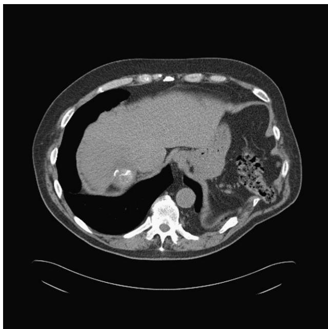
FIG. 2. Axial view computed tomography scan of the chest displaying colon and diaphragm herniation.

20 cases reported of abdominal contents herniating through intercostal spaces. 1-3 The hypothesized cause of these hernias is multifactorial. A weakness in the thoracic wall and the natural pressure gradient between the intra-abdominal and intrathoracic spaces contribute to this unique situation.