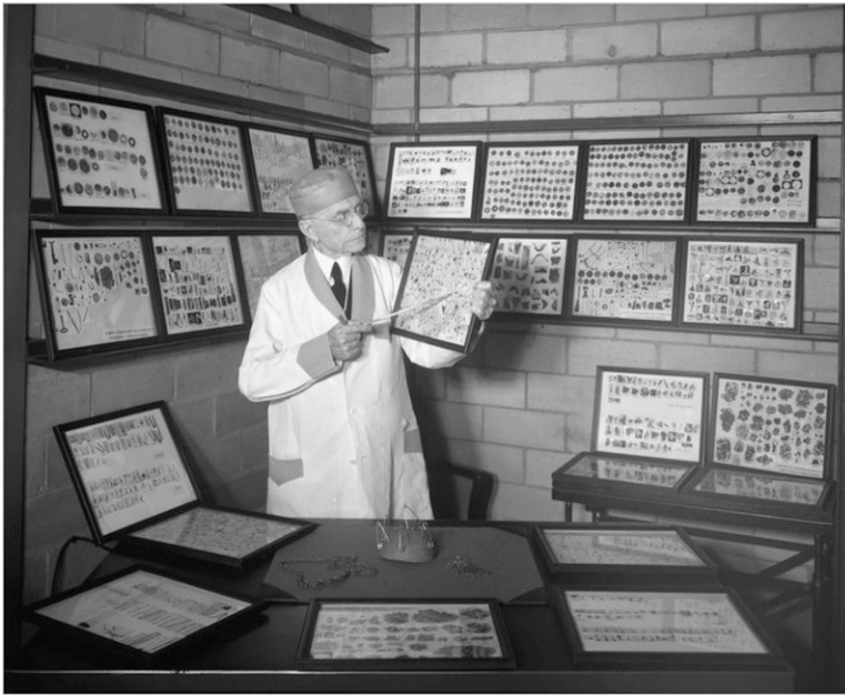
FIG. 3. Jackson and his collection of over 2000 objects removed from his patients, now housed at the Mütter Museum in Philadelphia.

for his cause. After endless meetings, presentations, and lectures with constituents and their legislators alike, the Federal Caustic Act was passed and signed by President Coolidge in 1927. 3