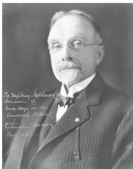
FIG. 2. Portrait photograph of Chevalier Q. Jackson, M.D., approximately 1930. Reprinted from Chevalier Jackson (1865–1958), Sc.D., 1923, portrait photograph.

He would stay for the next five years on the Ohio River hills. Despite his ailments, he would characteristically not rest. Instead, he took his limitations on clinical practice as an opportunity to record in text and illustrations his newfound art of peroral endoscopy. The publishing (in the year 1915) and booming popularity of Jackson's "Peroral Endoscopy and Laryngeal Surgery" further bolstered his burgeoning reputation. Already elected, at the young age of 35, to the Chair of Laryngology at the Western Pennsylvania Medical