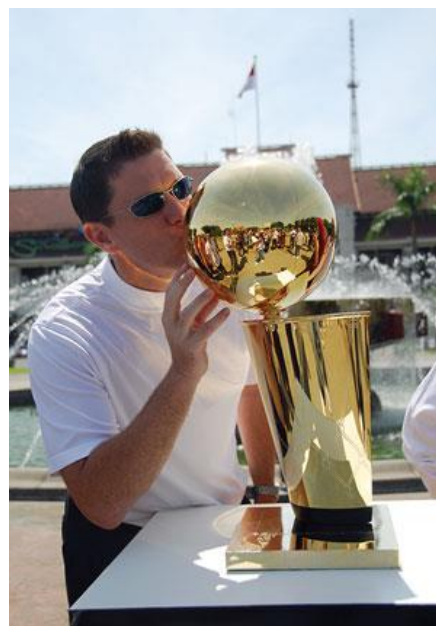
Winkle makes contact with the NBA championship trophy in Indonesia.

“It’s harder to reach consumers,” says Winkle. The challenge to create strategies that attract and engage customers in meaningful ways can be daunting in today’s competitive, fragmented and rapidly changing media landscape. But it helps that the NBA spotlights so many engaging personalities among its players and coaches, captivating fans around the world.