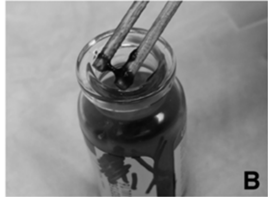
Figure 1: Image A shows an example of no macroscopic clot. Image B shows an example of a macroscopic clot