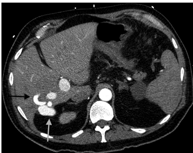
Figure 1. Enhanced CT of the chest remarkable for the presence of an abnormally hypertrophied segment 7 artery (black arrow) with arterialization of the portal venous system (white arrow), suggestive of an arterial venous fistula.

During his admission, he developed dyspnea and subsequently underwent arterial-phase chest CT to rule out a pulmonary embolus. The unexplained dyspnea resolved quickly and spontaneously, and the CT revealed no acute pulmonary process. However, it incidentally demonstrated a large enhancing vascular structure in the posterior aspect of the right hepatic lobe as well as atrophy of the right hepatic lobe (Figure 1). Based on this finding, an arteriovenous malformation was suspected as the etiology of his portal hypertension. Abdominal magnetic resonance angiography demonstrated an APF involving the right hepatic artery, segment 7, to the