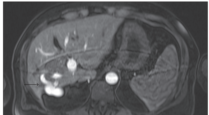
Figure 2. T1-weighted axial volumetric interpolated breath-hold examination arterial-phase magnetic resonance image demonstrating the arterial venous fistula (arrow).

right portal vein with near-complete atrophy of the right hepatic lobe (Figure 2). After further discussion with the patient, he recalled sustaining a liver laceration from blunt abdominal trauma at the age of 15, which was deemed the likely etiology of the vascular malformation.