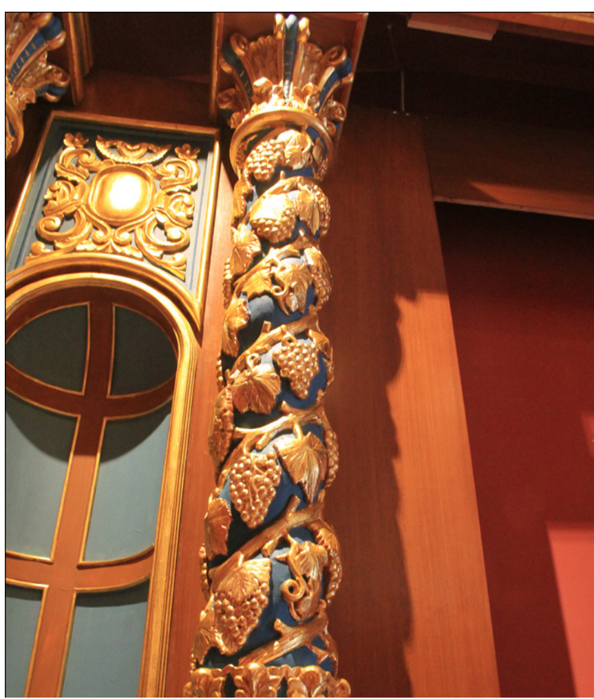
Details from La Merced. The work of volunteer artisans.