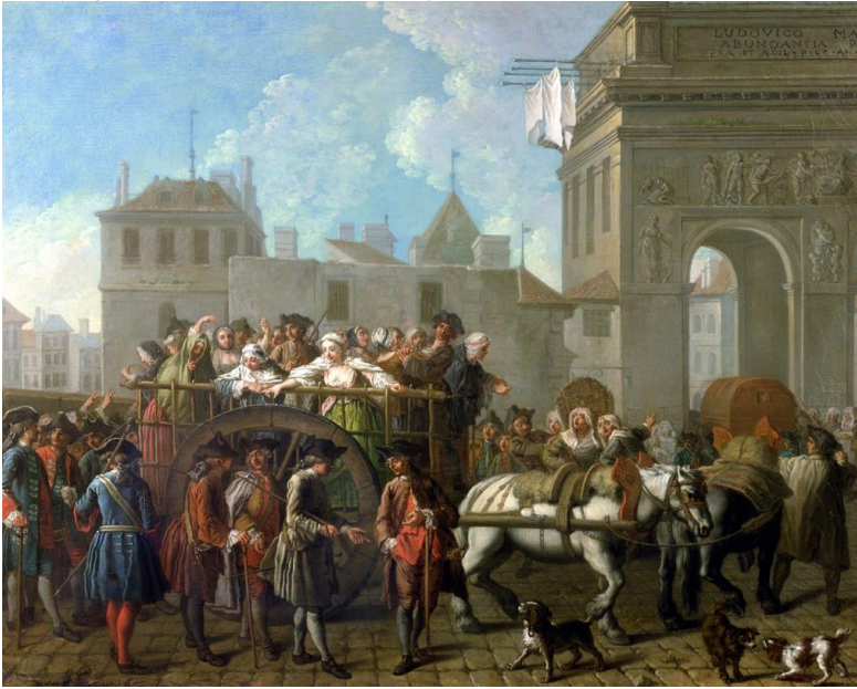
"Transport of Prostitutes to the Salpêtrière", c.1760-70 (oil on canvas).

© Jeaurat, Etienne (1699-1789); Bridgeman Images, Musée de la Ville de Paris, Musée Carnavalet, Paris, France.