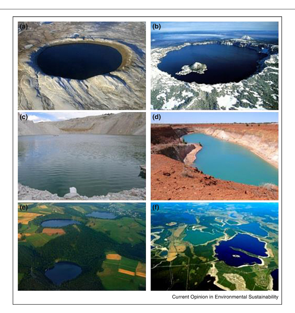
Mine pit lakes are similar to natural crater lakes with steep, mobile banks, little vegetation, and small catchments. (a) Pingualuit meteorite impact crater in Nunavik, Quebec, Canada, (b) Crater Lake, Oregon, (c) Highland Valley Copper pit lake (BC, Canada), (d) gold mine-pit lake in Laverton, Western Australia, (e) maar district, Daun, Germany, (f) lignite pit lake district, Lusatia, Germany.

safety criteria on the company that must be met in accordance with state and/or national legislation, which varies world-wide [see 11]. Where pit lakes occur near populated areas, communities can serve a vital role in the MCP process by helping to define the ultimate use of the pit lake and surrounds. Pit lakes, while posing risks to a catchment, can also have significant benefits if remediated, providing space for recreation and environmental amenity, as well as alternative industries (e.g., tourism, aquaculture, irrigation) that allow small towns to survive economically after the mining ends [12].