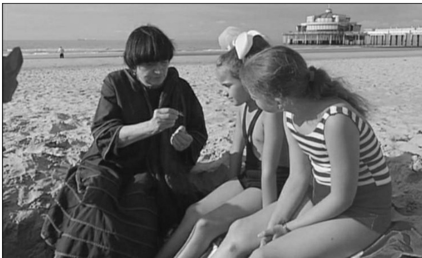
FIGURE 1. Varda recreates events from her youth on the beach. Agnès Varda, Les Plages d'Agnès (2008). © Ciné-Tamaris/Cinema Guild.

camera, the film refuses to give a univocal idea of either the beach or the filmmaker, insisting on both of them as processes formed through relations between elements. It is precisely by suggesting meanings but refusing to confirm them that Les Plages d'Agnès offers up the beach as a site that can allow for eternal configurations and re-configurations of both space and the self. Varda's film becomes a feminist project in that it refuses to capture and fix the meaning of its subject, suggesting that this meaning is as friable and fragile as the shifting sands of the beaches of its title.