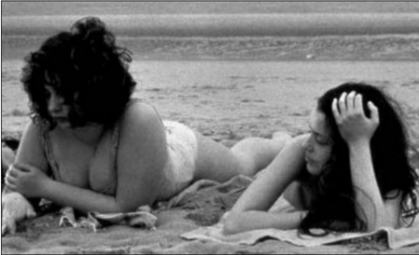
FIGURE 2. Breillat emphasises the difference between the girls' bodies in the beach scenes. Catherine Breillat, À ma sœur (2001).

Anaïs in À ma sœur and Frédérique in La Baule Les Pins use their experience of the beach to inform themselves critically about the configuration of female heterosexuality in French society. At the beach, the constructed nature of the gendered body is revealed precisely because culture and nature are placed into a relation different from that in most locations. It is thus a site in which the girls can attempt some self-invention beyond the dictates of the family structure that would contain them.