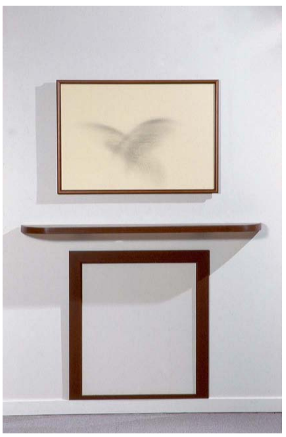
Top: Tom Marioni, Café Wednesday (1992). © Tom Marioni. Courtesy the artist. Left: Tom Marioni, By The Fire (1994). Tableau sculpture. 7 x 4 x 1 feet. Wood and framed drum brush drawing. © Tom Marioni. Courtesy the artist.