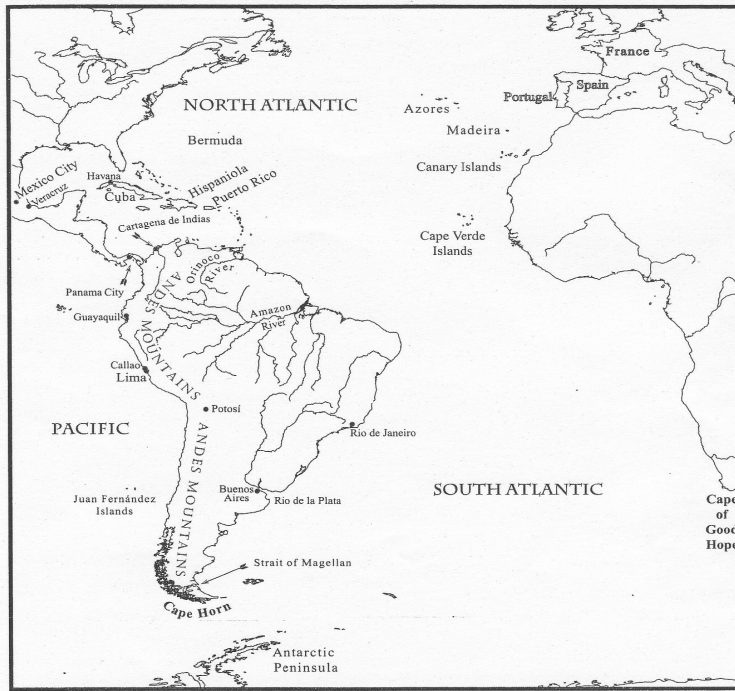
The oceanic connections between Spain and its American empire in 1700. Lawrence V. Mott