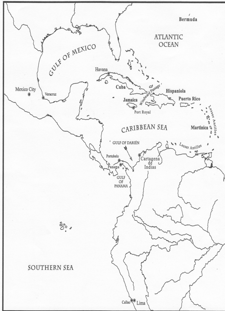
From the Gulf of Mexico to Peru, the main area of concern for Spanish viceroys in 1700.