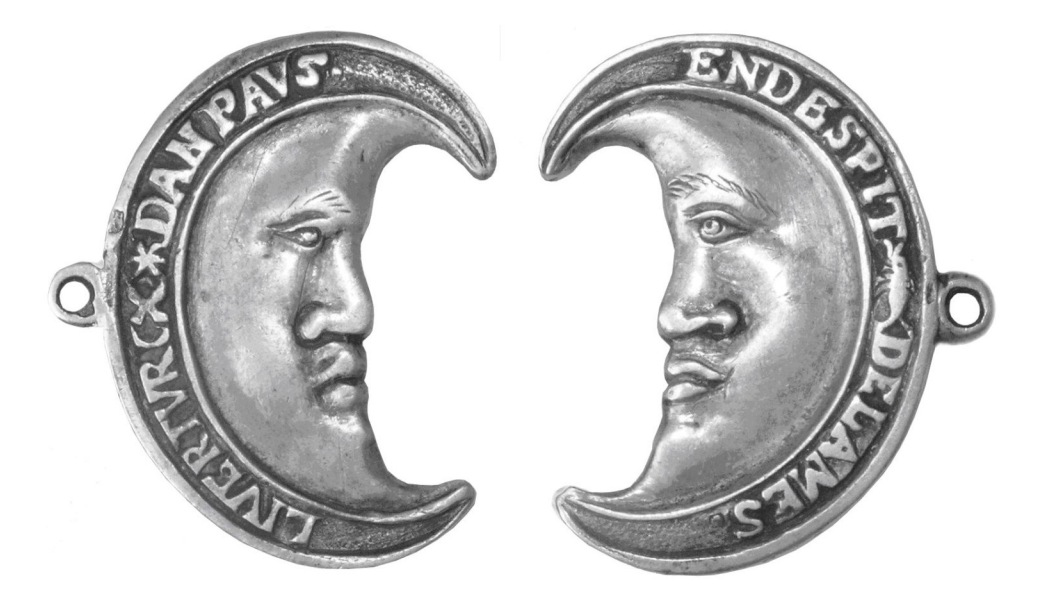
Silver crescents worn by the Dutch from 1566 to 1574, reading 'Rather Turk than Pope' (Rijksmuseum Amsterdam).

Historian Jan Fruytiers adds the trustworthiness of the Turk as a legitimation of the slogan on the medallions: