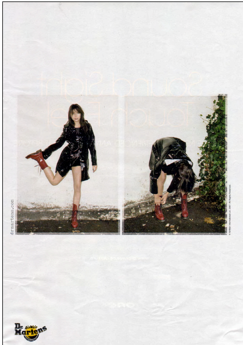
Illustrative example 1: Doc Martin 2008

EIASM Workshop on Imagining Business Oxford University June 2008