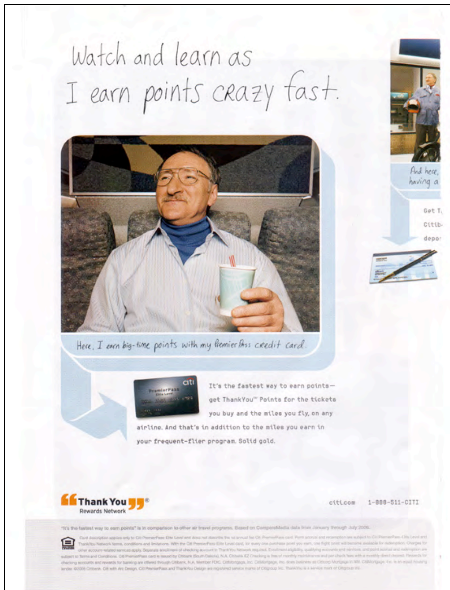
Illustrative example 2: Citibank 2006

As internationally celebrated fashion photographer Terry Richardson explains: “Ninety percent of the images I’ve ever taken have been done with a small camera. You don’t have to focus it or do a light reading. You can’t fuck up. And because you don’t have full control over it, they allow for accident. . . . Those cameras aren’t invasive. It’s less formal” (quoted in Braddock 2002, 161). Vogue magazine editor Robin Derrick agrees: “Snap cameras, rather than elaborate technical cameras, put the emphasis back on the photographer as auteur, rather than as technician. . . . With point-and-shoot cameras, what