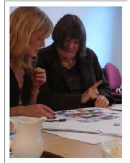
Concept Design Workshop November 2009

Please feel free to leave comments on anything that you read on the blog.