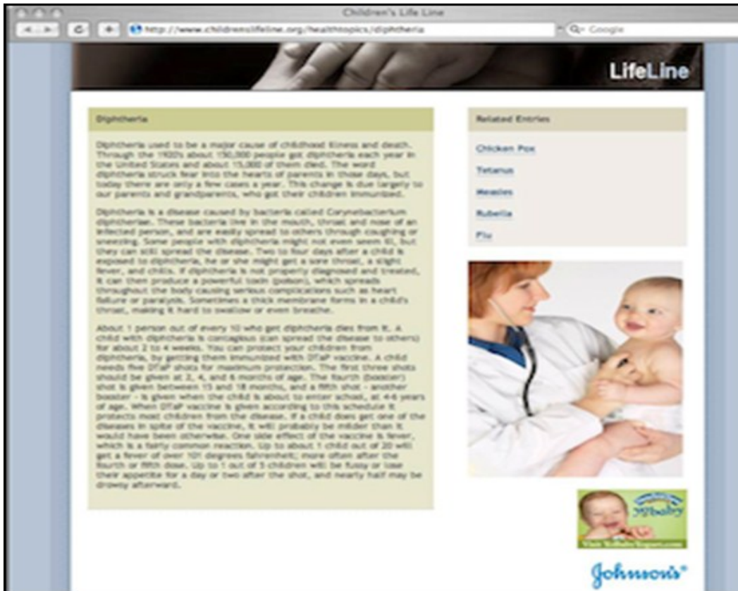
FIGURE 3 – Low Credibility, High Design Quality