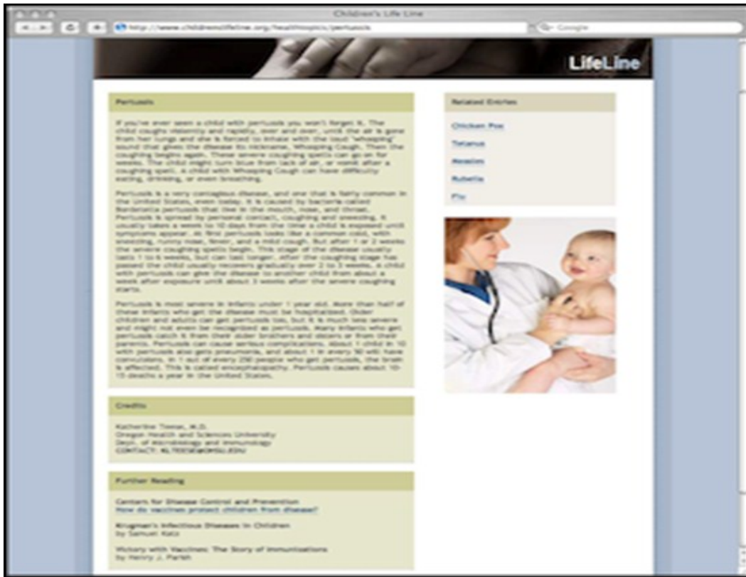
FIGURE 1 – High Credibility, High Design Quality