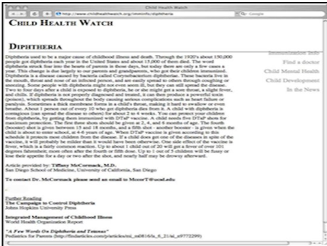
FIGURE 2 – High Credibility, Low Design Quality