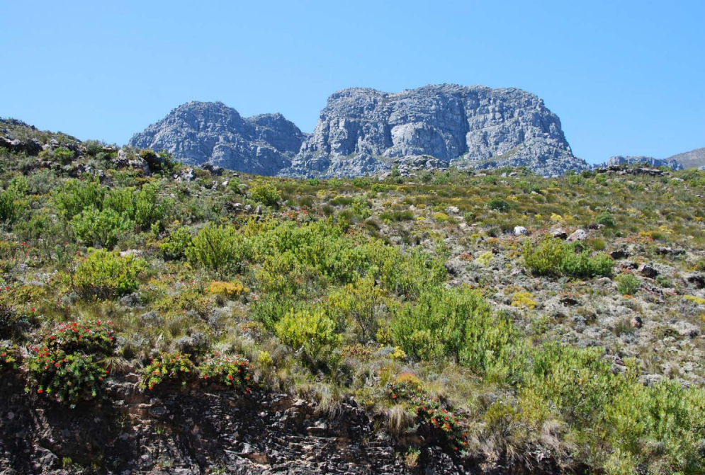
Figure 4. Limietberg Nature Reserve, Western Cape.