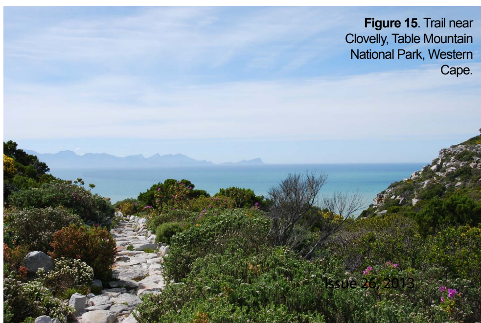
Figure 15. Trail near Clovelly, Table Mountain National Park, Western Cape.