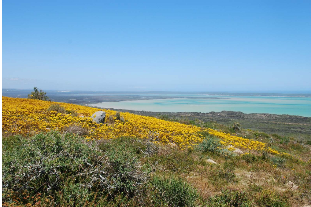
Figure 14. Same hill as in Fig. 13, West Coast National Park, Western Cape.