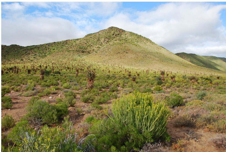
Figure 11. View of hill visited for hilltopping tachinids, Gamkaskloof Die Hel, Swartberg Nature Reserve, Western Cape.

Collection data: 33°22'5.90"S 21°37'19.43"E (hilltop), 17–18.x.2012, 336 m.