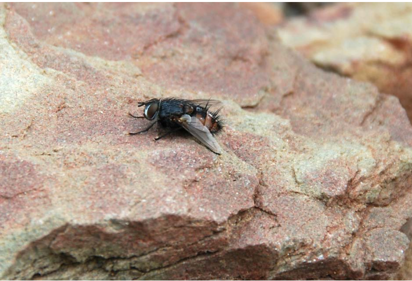
Figure 12. Smidtia capensis (Schiner) on hilltop shown in Fig. 11.

Genus C sp. [1 male, 1 female]. These specimens were