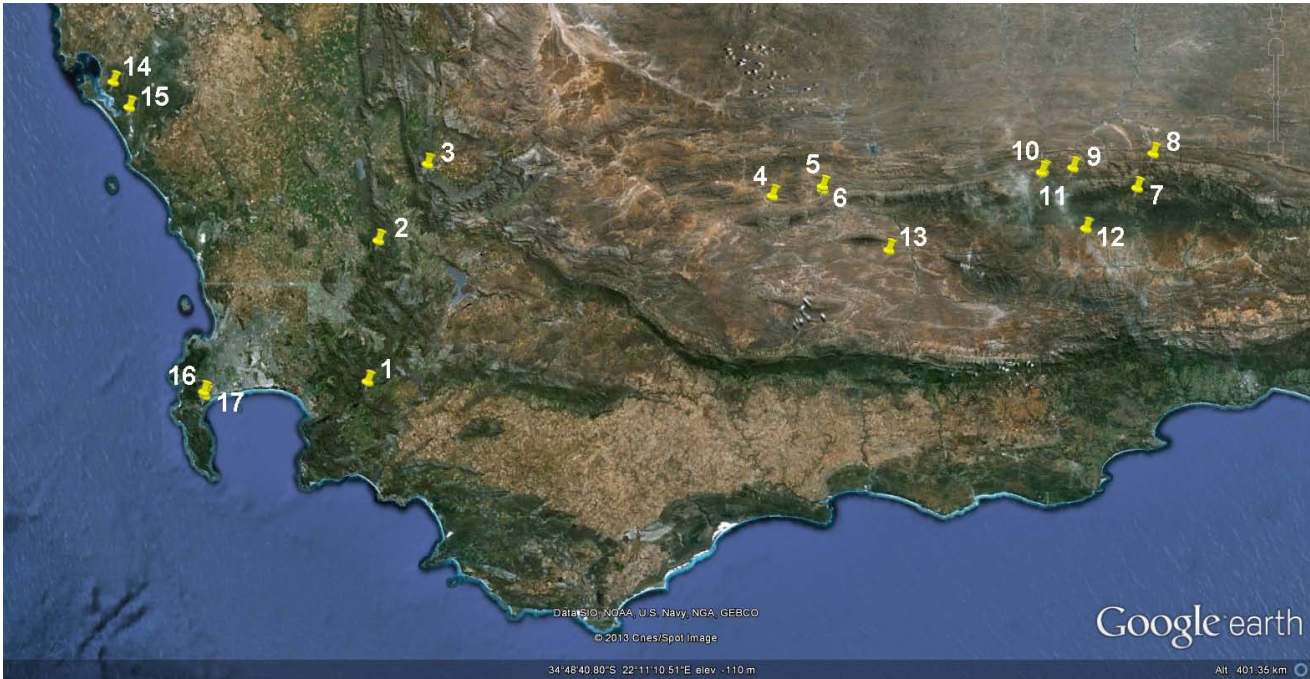
Figure 3. Map of the southern portion of the Western Cape Province of South Africa showing where we collected. The numbers correspond to the numbered sites in the text.

in the 19th Century (see O'Hara's article). We were pleased to be following in this grand tradition of Cape collecting, albeit at a somewhat less adventurous time.