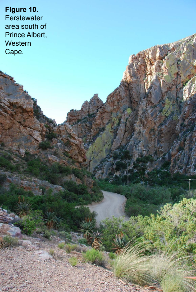
Figure 10. Eerstewater area south of Prince Albert, Western Cape.