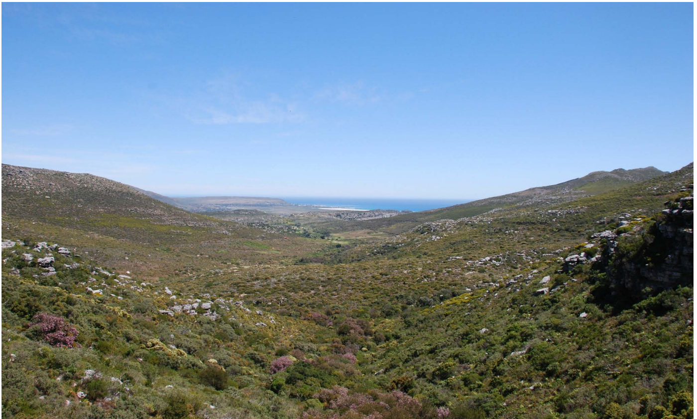
Figure 16. Near Echo Valley, Table Mountain National Park, Western Cape.