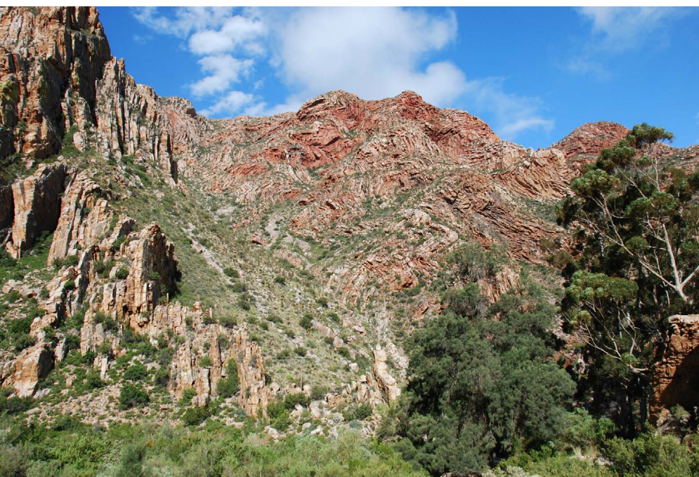
Figure 9. Eerstewater area south of Prince Albert, Western Cape.

Chaetoria cf. stylata Becker, 1908 [1 male]