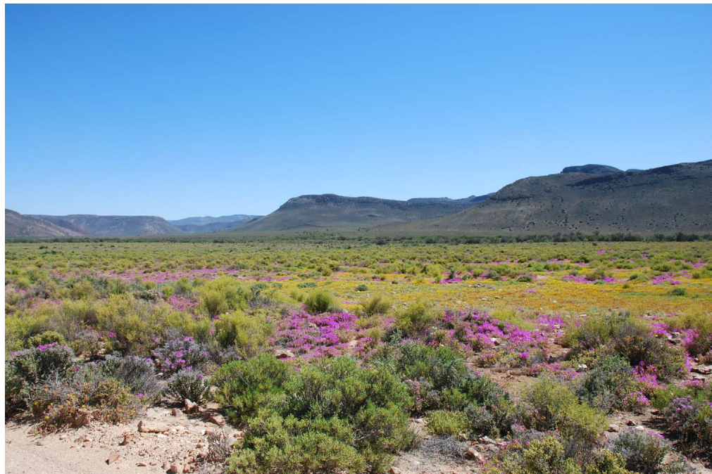
Figure 5. Anysberg Nature Reserve, Western Cape.

Cylindromyia sp. [1 male]. This is a widespread and apparently undescribed South African species. Several conspecific specimens are preserved in the KwaZulu-Natal Museum.