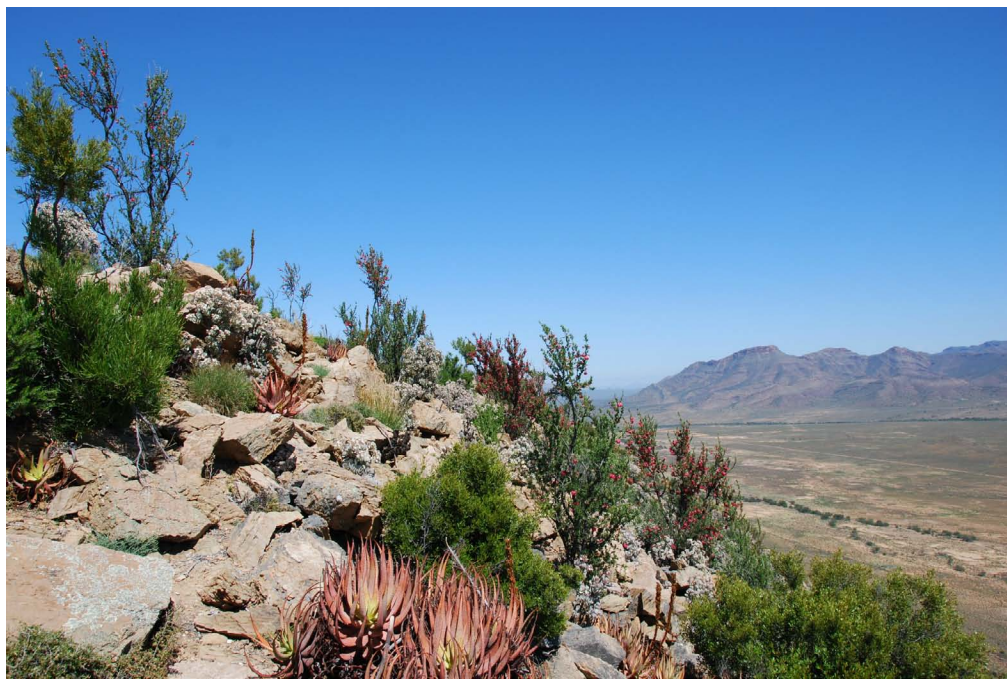
Figure 7. Hilltop, Anysberg Nature Reserve, Western Cape.

Pexopsis pyrrhaspis Villeneuve, 1916 [1 female]