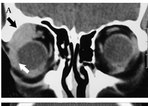
Figure 1 (A) A coronal CT image of case 3 showing a mass in the right lacrimal fossa indenting the globe with a relatively poorly defined inferior border (white arrow). The outer margin of the lesion with bone remodelling is marked with a black arrow. The histological diagnosis was follicular lymphoma. (B) An axial CT image of case 10 showing a well-circumscribed mass in the left lacrimal fossa with remodelling of the overlying bone (black arrow). The histological diagnosis was adenoid cystic carcinoma. (C) A coronal CT image of case 4 showing a wellcircumscribed mass in the right lacrimal fossa with remodelling of the overlying bone (black arrow). The histological diagnosis was mantle-cell lymphoma. (D) A coronal CT image of case 13 demonstrating a mass in the left lacrimal fossa, note the inferior border of the mass (white arrow). The histological diagnosis was reactive lymphoid hyperplasia.

A review of the recent literature on LGPA, however, suggests that a significant number of cases may present with symptoms and signs not usually associated with this lesion. Sen and coworkers<sup>8</sup> analysed a series of 32 cases of LGPA and found that the duration of symptoms was less than 10 months in 28% of cases. Calcification of the tumour, usually considered a sign of malignancy, has also been described in LGPA ^3 ^9 ^{10} and there is a report of a case with bone destruction. 11 Degeneration within LGPA giving the appearance of a cystic lesion is also described. 12 Conversely, symptoms and signs said to be characteristic of LGPA may be seen in a number of other lacrimal gland lesions, as evidenced by our series. Applying traditional clinicoradiological criteria, such as the algorithm devised by Rose and Wright, 3 thus often fails to distinguish between LGPA and other lacrimal gland lesions. We would like to emphasise that despite a detailed retrospective review of the case records, we were unable to discover any features that may have pointed to a different diagnosis in these cases, except perhaps for the short duration of